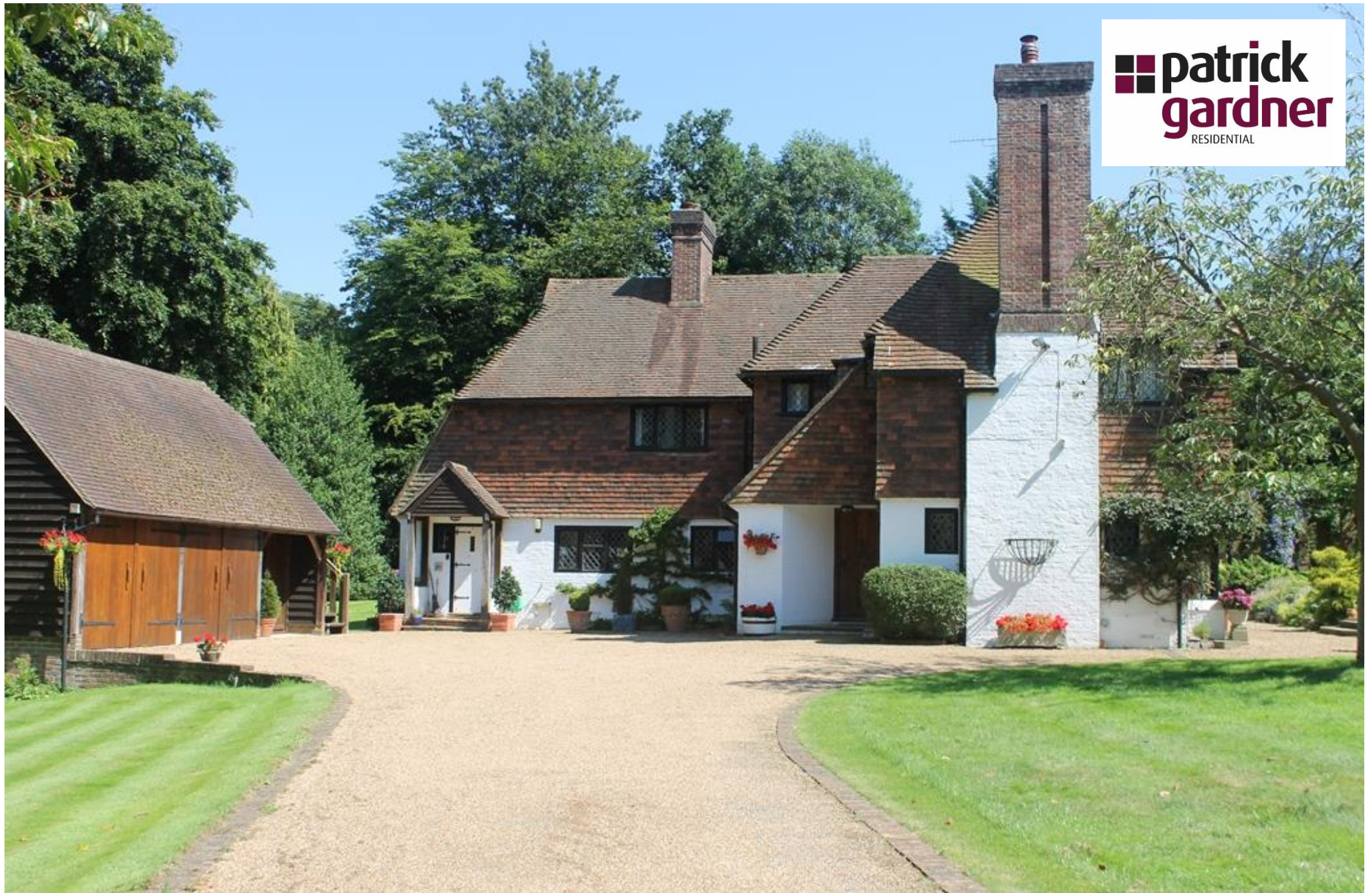
Cheyham , The Drive, Tyrrells Wood, Leatherhead, Surrey. KT22 8QJ