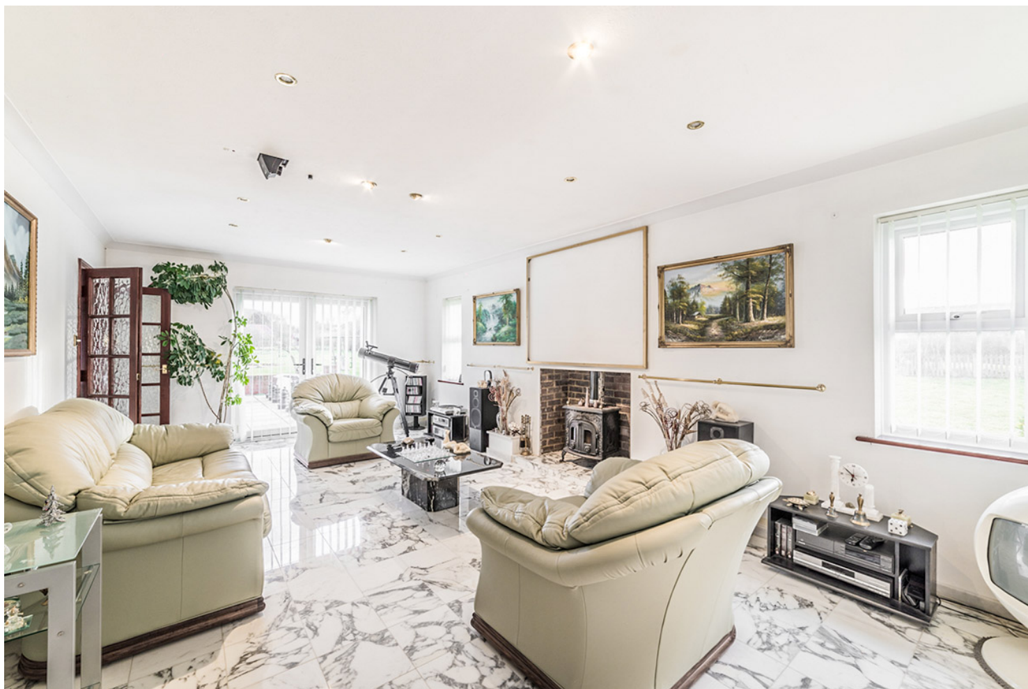
Margaret Cottage Pean Hill, Whitstable, Kent £875,000