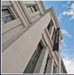
Almeida Theatre - 6 minutes by car