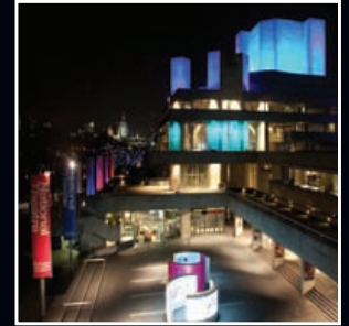
The South Bank - 30 minutes by tube & foot