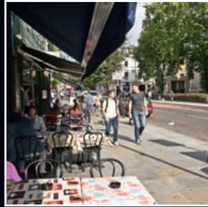
Upper Street - 5 minutes by car