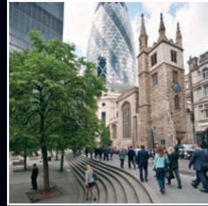
The City - 25 minutes by tube & foot