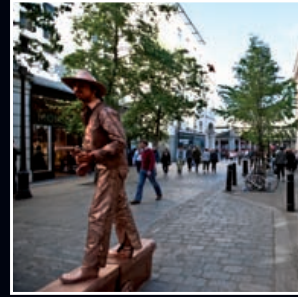
Covent Garden - 17 minutes by tube & foot