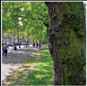
Highbury Fields - 10 minutes walk