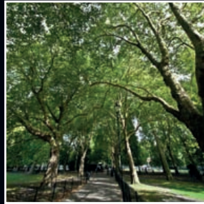
Hoxton Square - 10 minutes by car