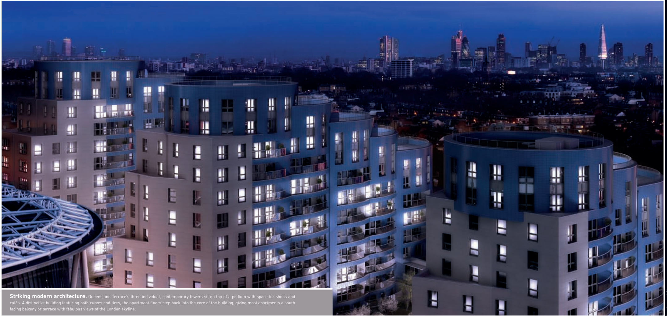
Striking modern architecture. Queensland Terrace's three individual, contemporary towers sit on top of a podium with space for shops and cafés. A distinctive building featuring both curves and tiers, the apartment floors step back into the core of the building, giving most apartments a south facing balcony or terrace with fabulous views of the London skyline.