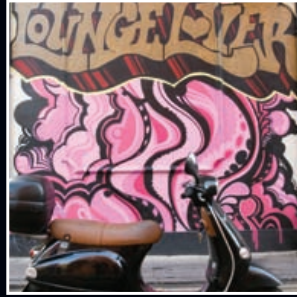
Shoreditch - 9 minutes by car