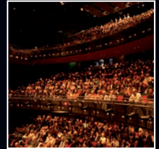
Sadler's Wells - 25 minutes by bus & foot