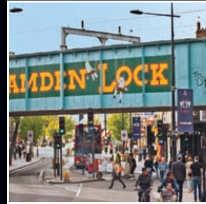
Camden Town - 22 minutes by bus & tube