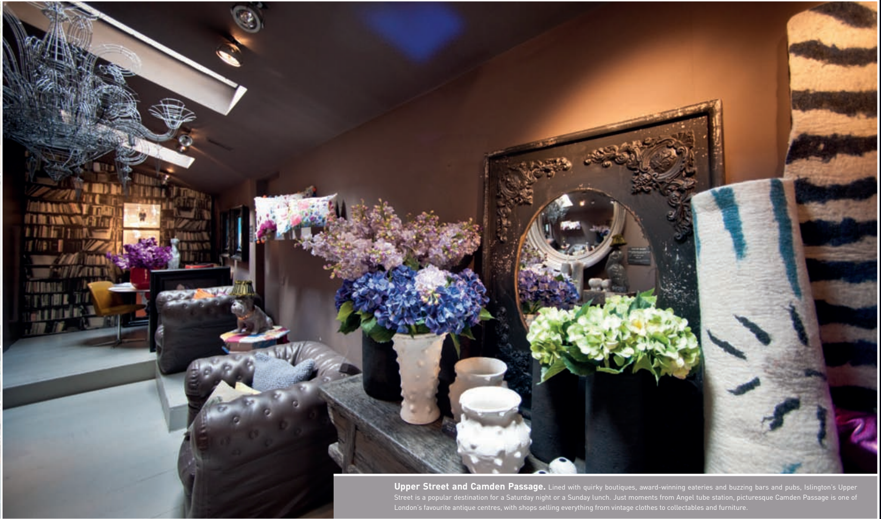
Upper Street and Camden Passage. Lined with quirky boutiques, award-winning eateries and buzzing bars and pubs, Islington's Upper Street is a popular destination for a Saturday night or a Sunday lunch. Just moments from Angel tube station, picturesque Camden Passage is one of London's favourite antique centres, with shops selling everything from vintage clothes to collectables and furniture.