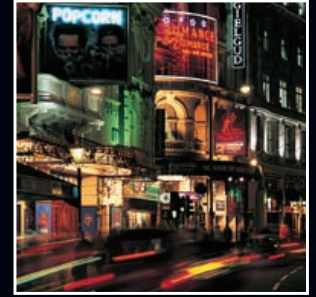
The West End - 20 minutes by tube & foot