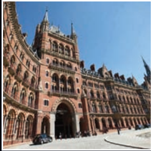
King's Cross St. Pancras - 10 minutes by tube & foot