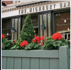
Highbury Village - 10 minutes walk