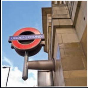
Holloway Road tube station - 6 minutes walk