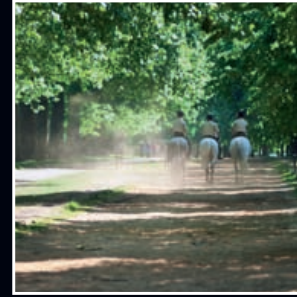
Hyde Park - 27 minutes by tube & foot