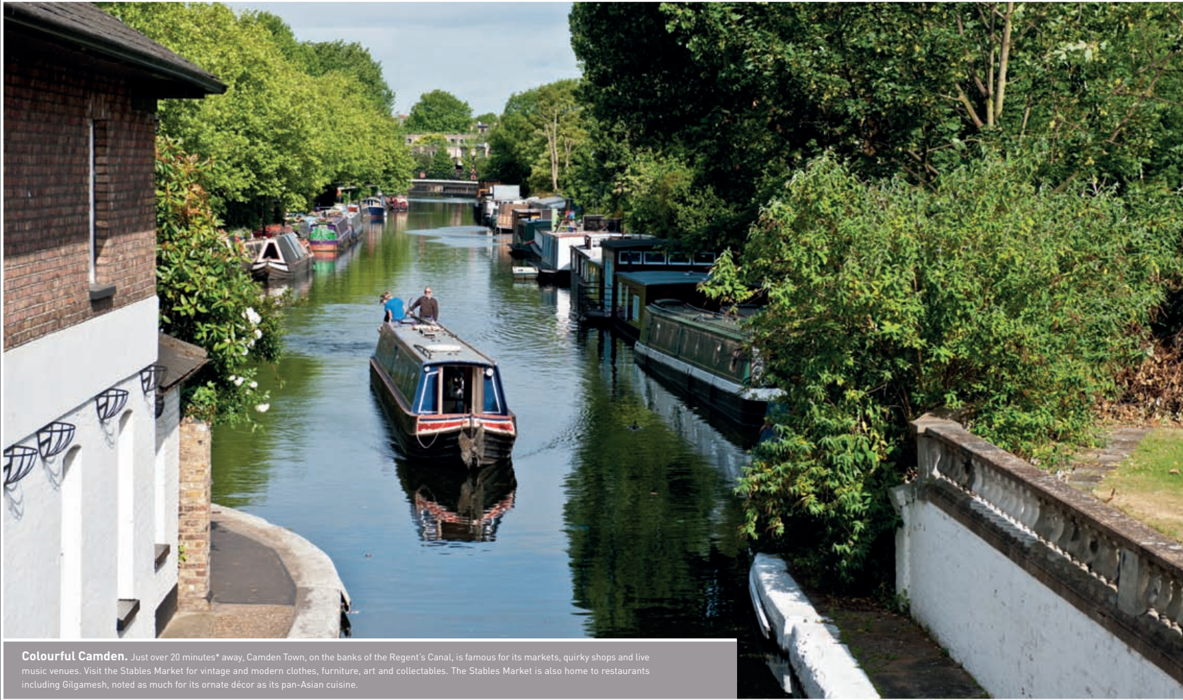
Colourful Camden. Just over 20 minutes* away, Camden Town, on the banks of the Regent's Canal, is famous for its markets, quirky shops and live music venues. Visit the Stables Market for vintage and modern clothes, furniture, art and collectables. The Stables Market is also home to restaurants including Gilgamesh, noted as much for its ornate décor as its pan-Asian cuisine.