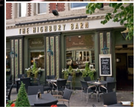
Exploring Highbury Village. Just a few minutes walk away, pretty Highbury Village is home to some fine independent shops and several good pubs. La Fromagerie is one of the best cheese shops in England* featuring a walk-in cheese room and a tasting café, while Godfreys, the award-winning** butcher founded in 1905, offers a butchery school alongside their fantastic produce.