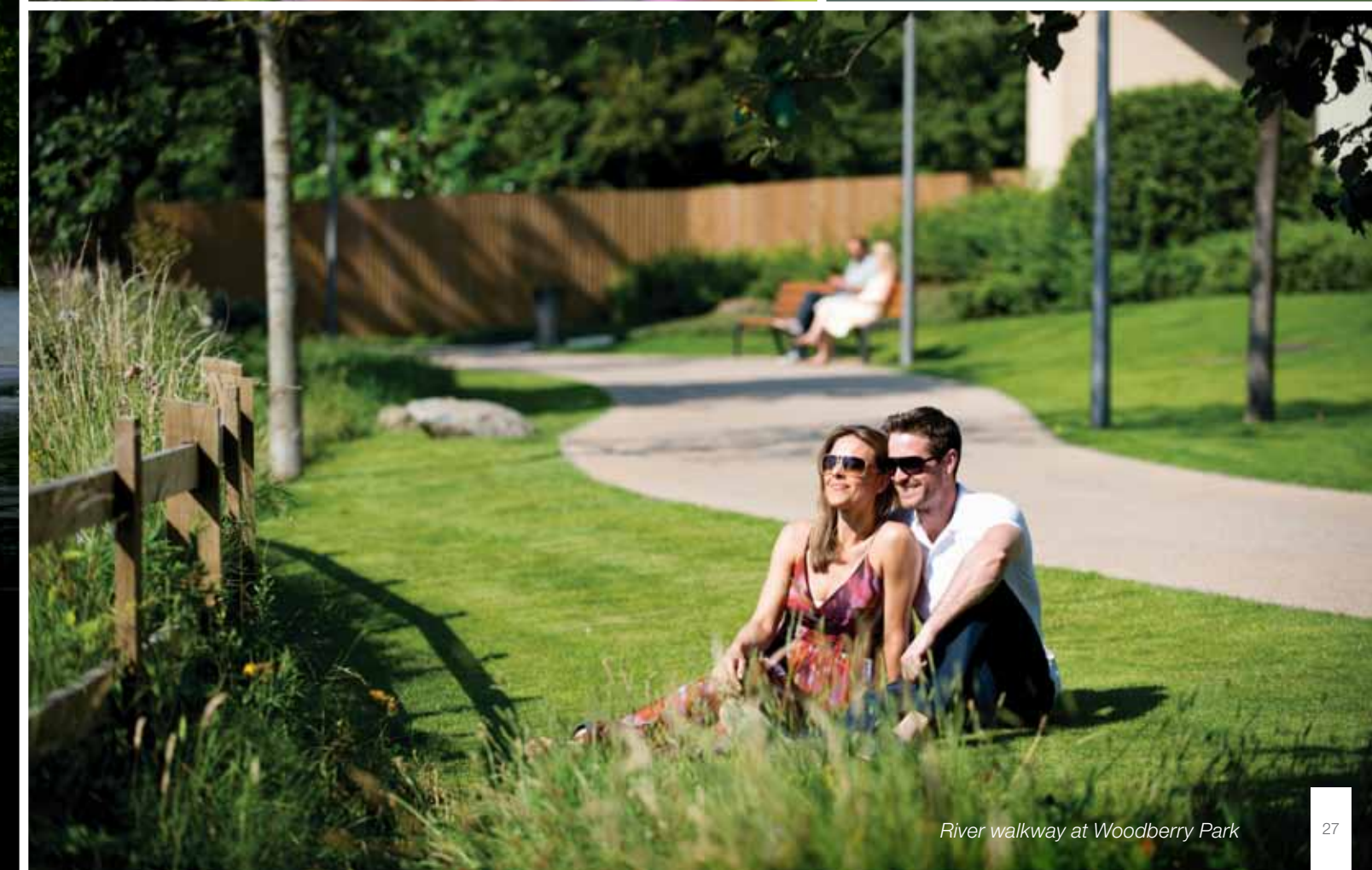
River walkway at Woodberry Park