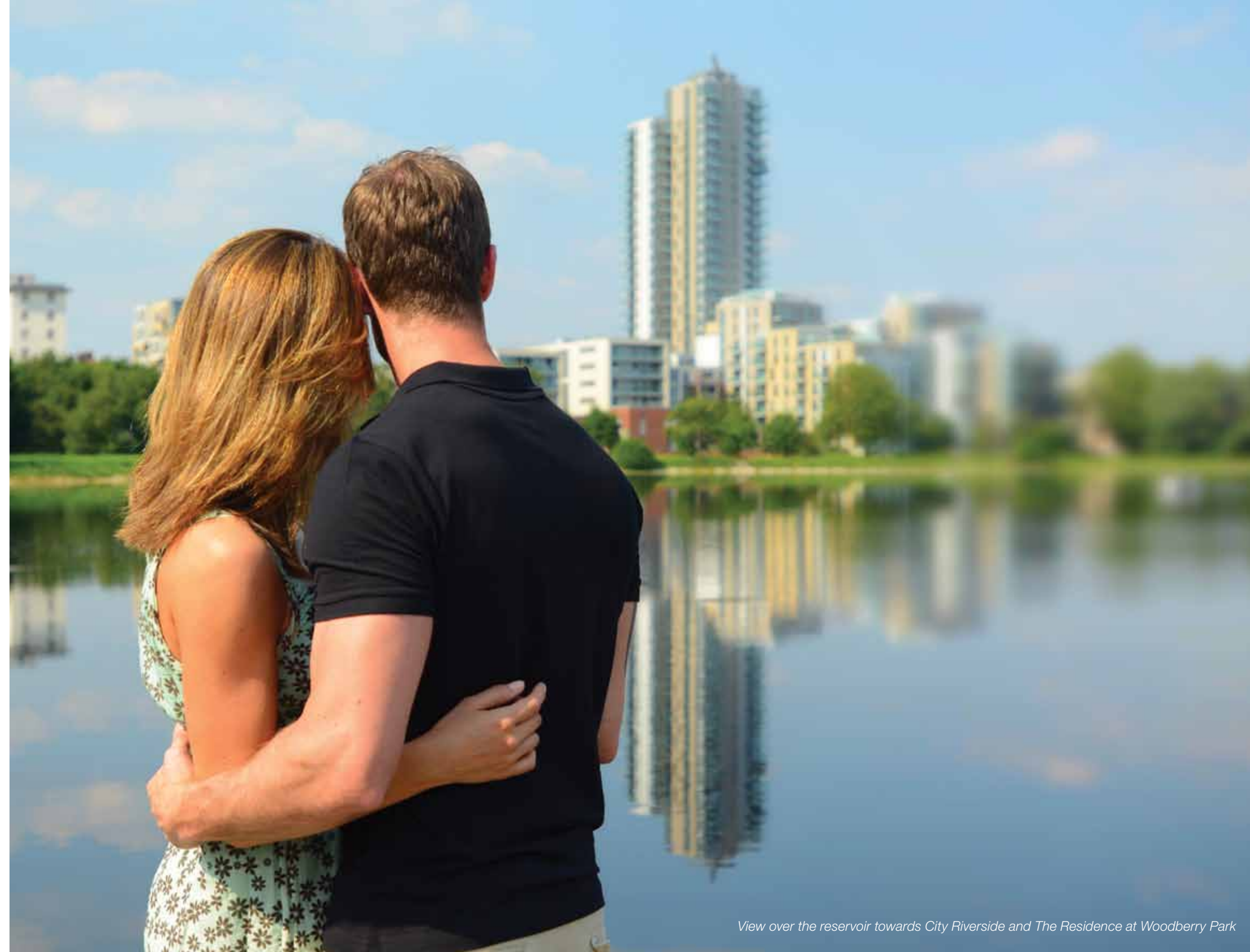
View over the reservoir towards City Riverside and The Residence at Woodberry Park

For football fans, the world famous Arsenal Football Club is just around the corner, whilst White Hart Lane, home to Tottenham Hotspur, is a short distance away.