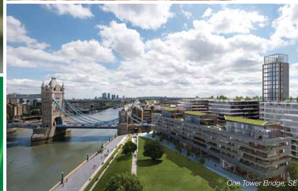
One Tower Bridge, SE1