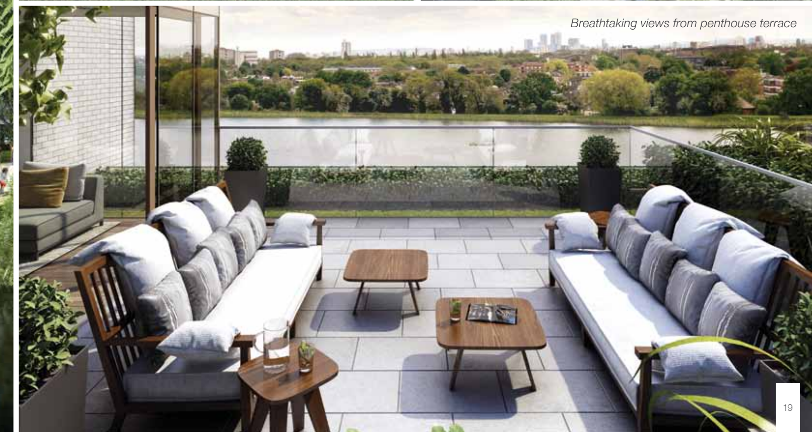
Breathtaking views from penthouse terrace