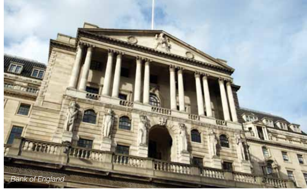
Bank of England

The above journey times are from the Manor House Tube Station and have been calculated using Transport for London Journey Planner.