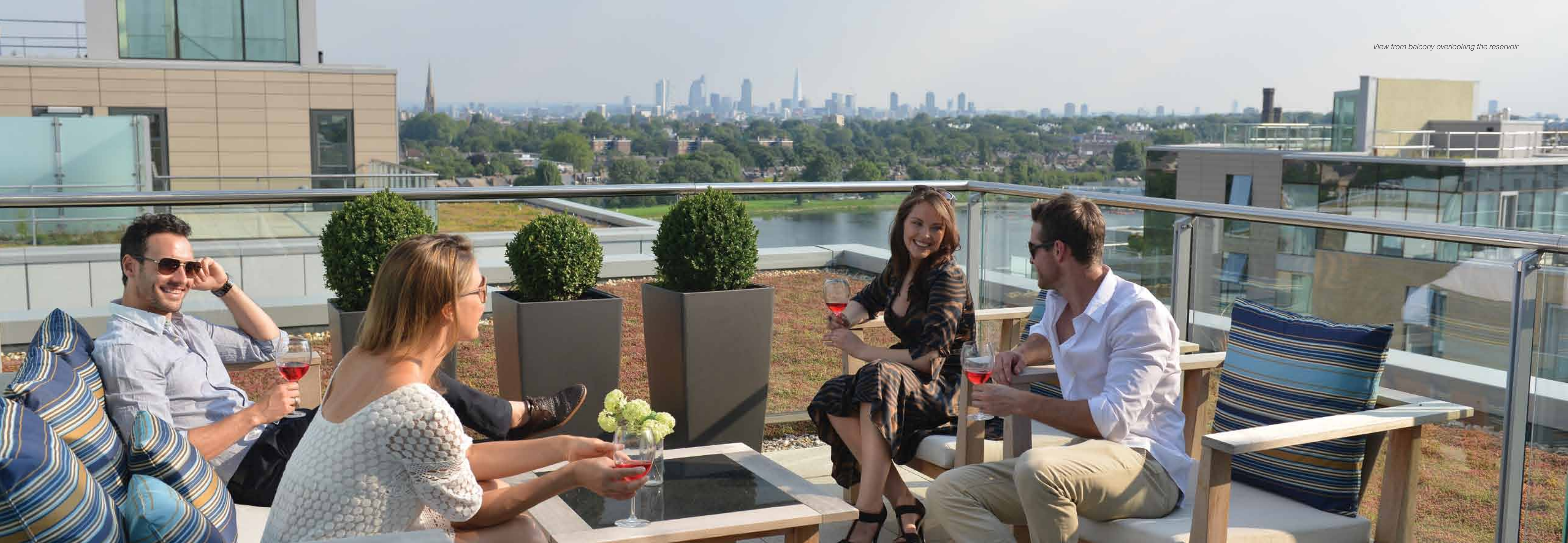
View from balcony overlooking the reservoir