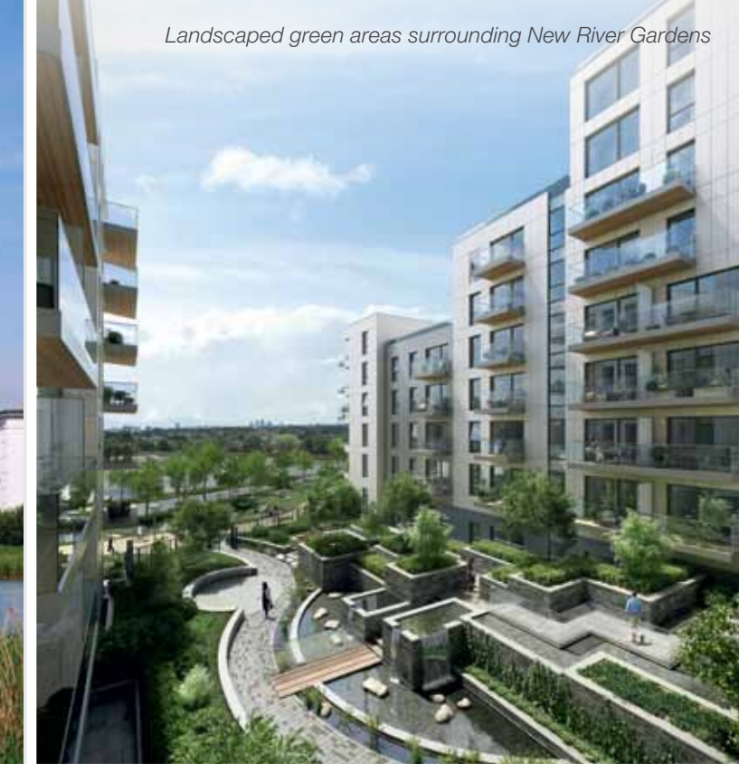
Landscaped green areas surrounding New River Gardens