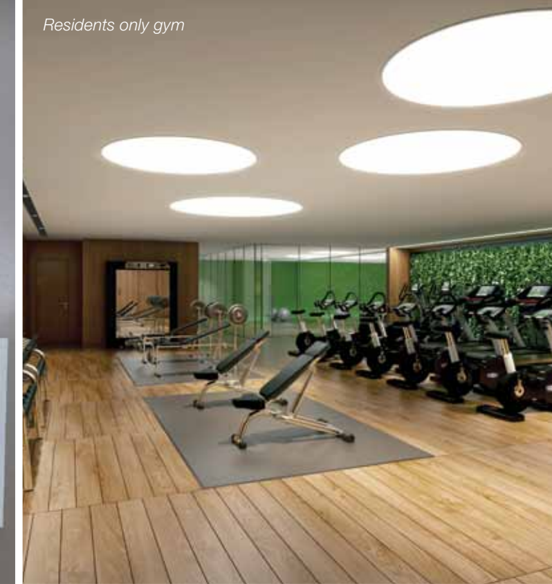
Residents only gym