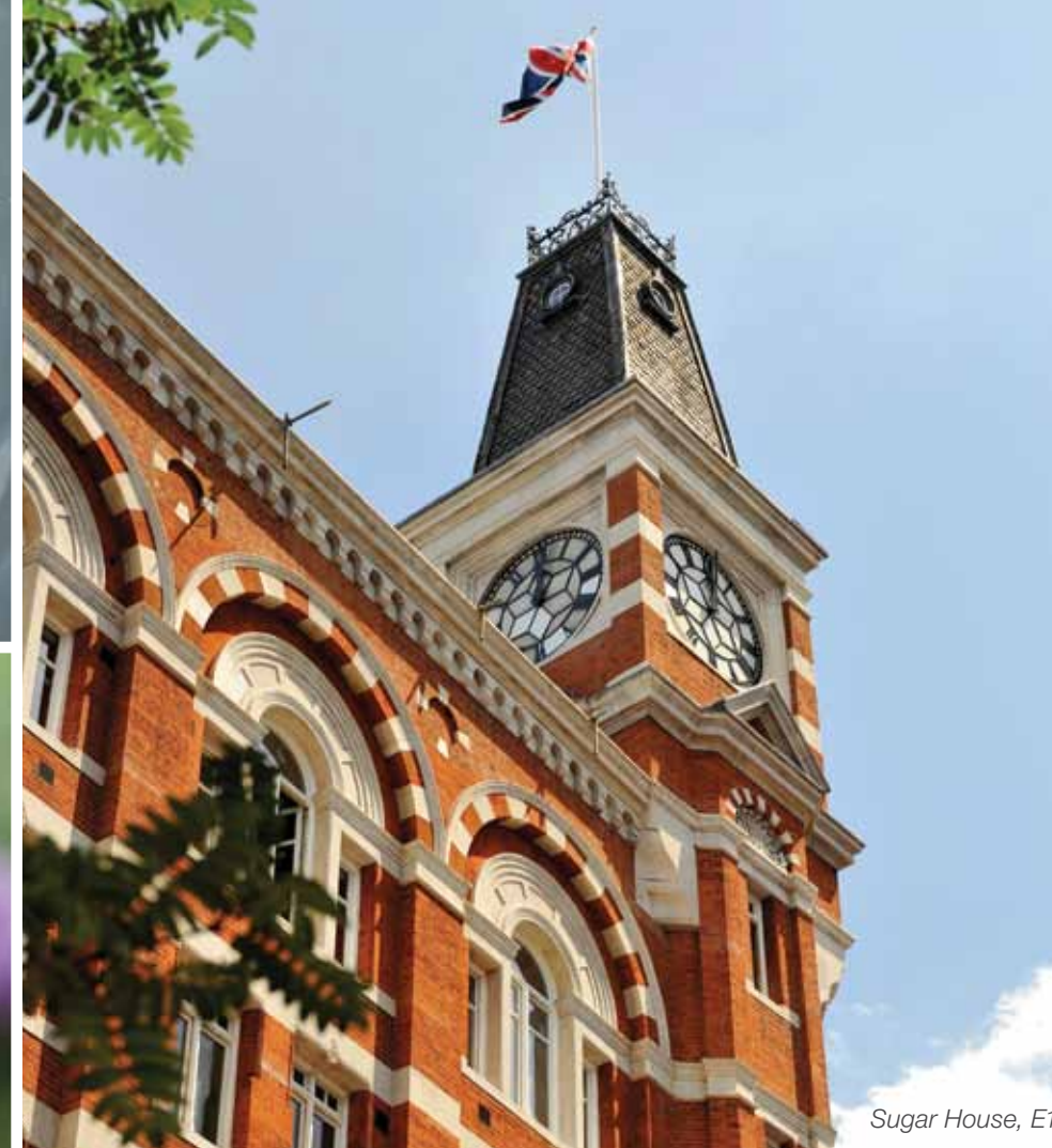
Sugar House, E1