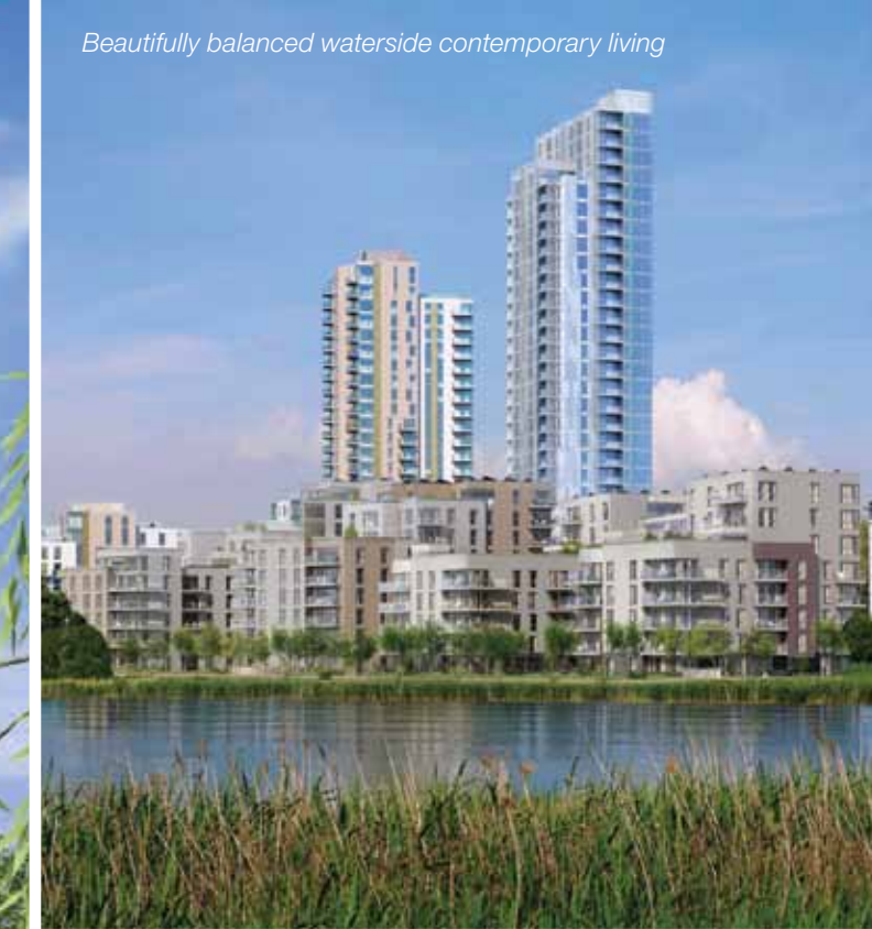
Beautifully balanced waterside contemporary living