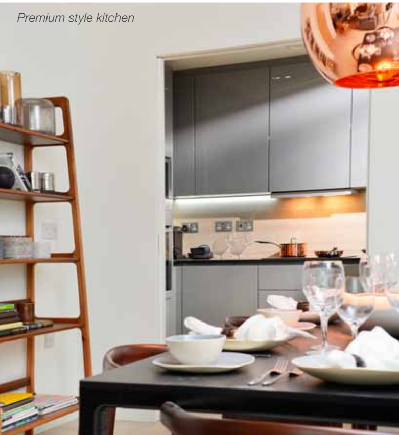
Premium style kitchen