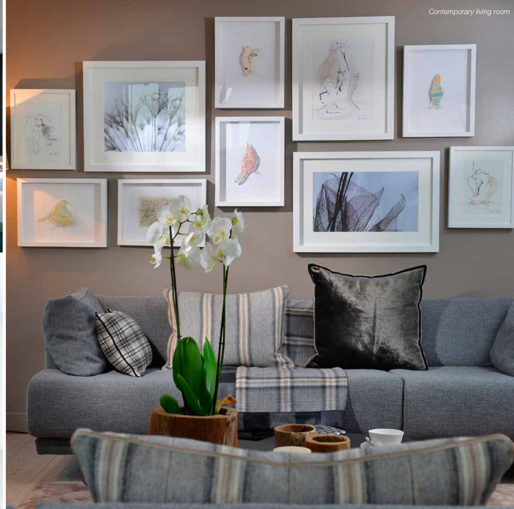
Contemporary living room