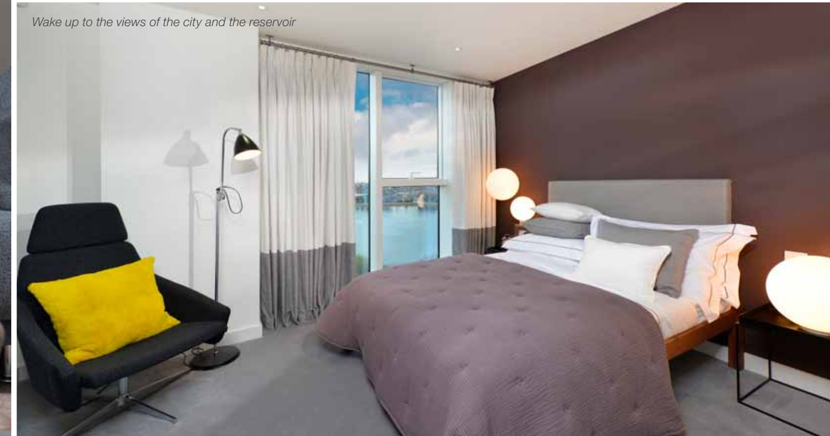
Wake up to the views of the city and the reservoir