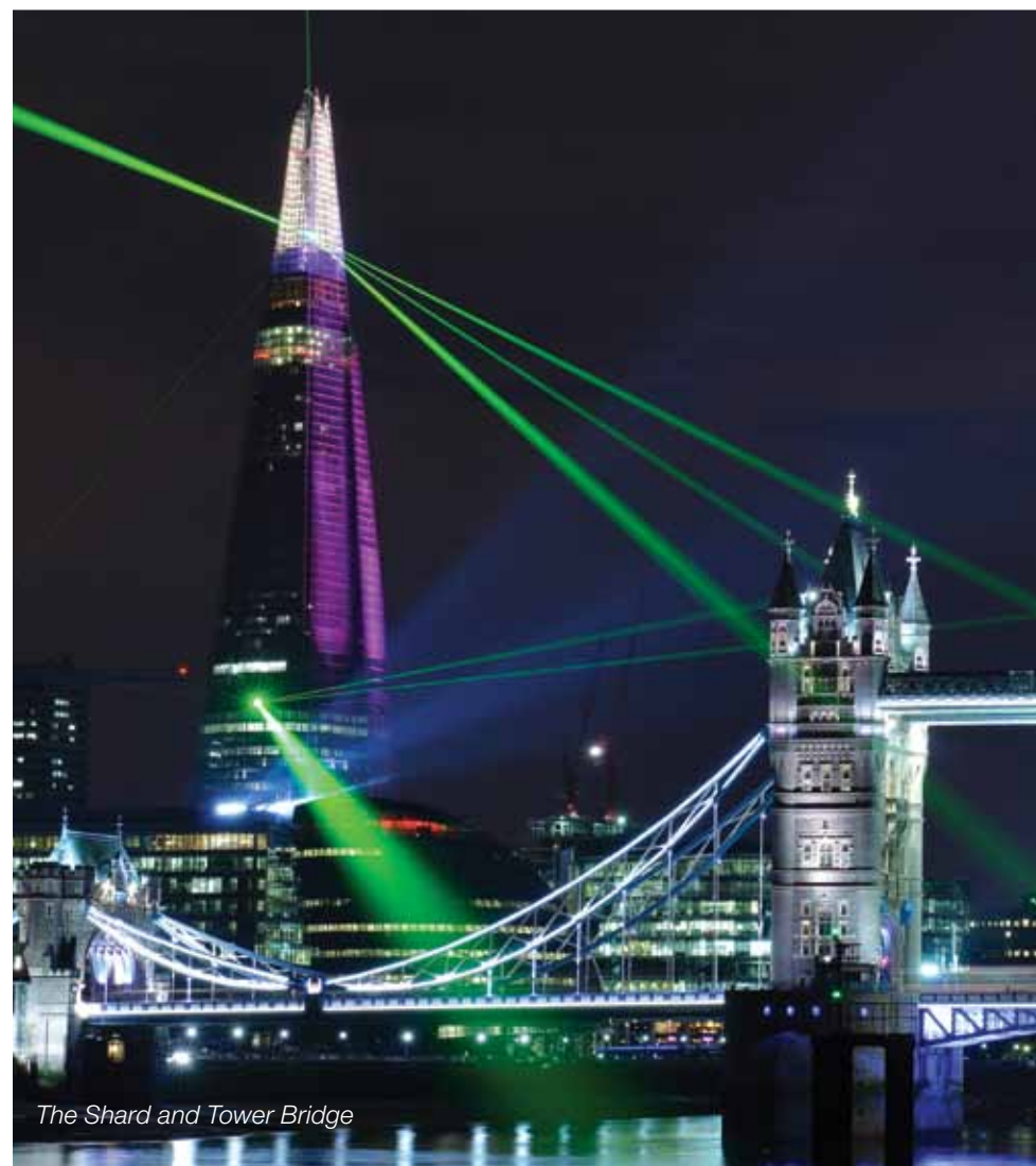
The Shard and Tower Bridge