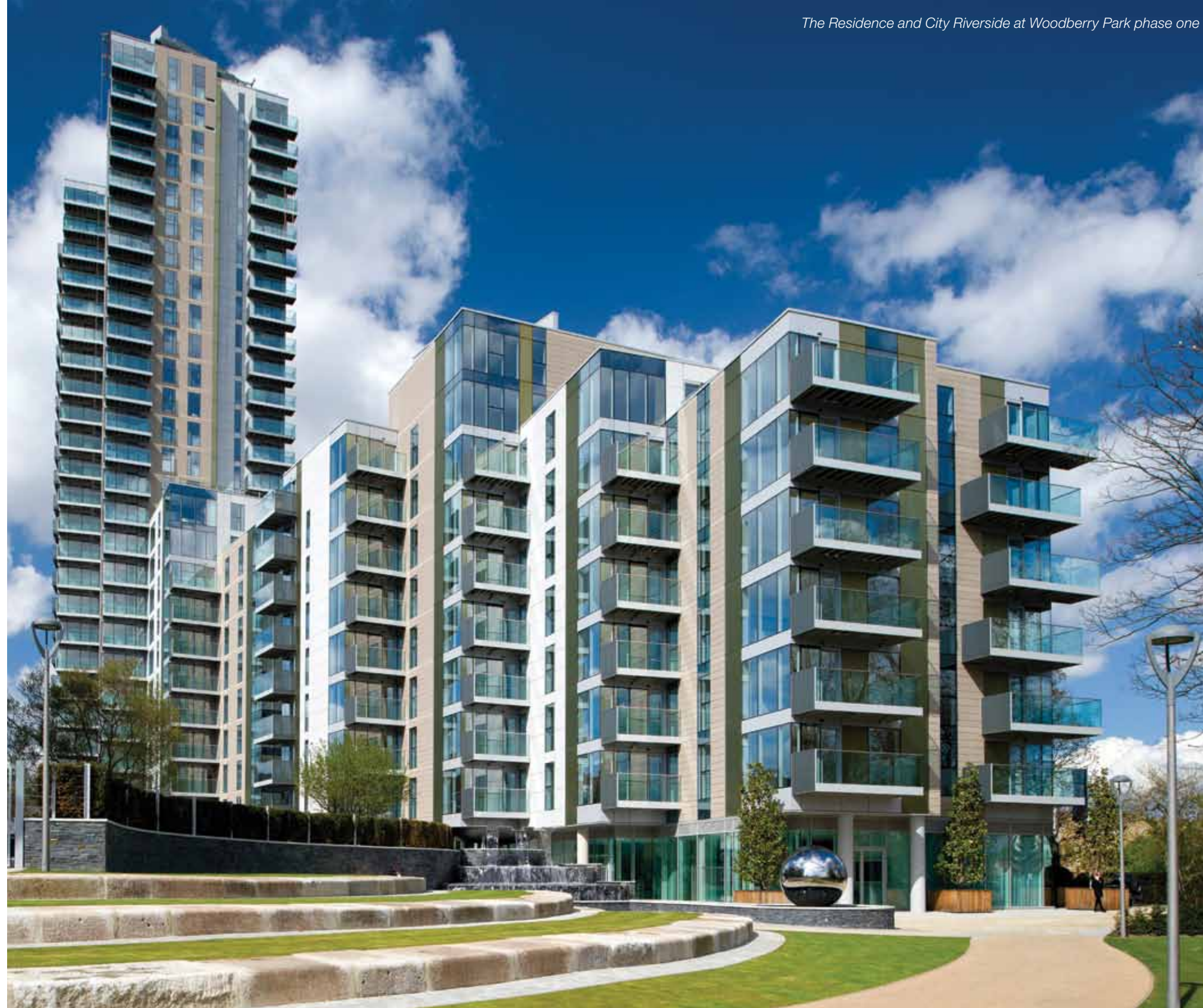
The Residence and City Riverside at Woodberry Park phase one

The Residence a 27 storey iconic tower, sits proudly at the entrance of the development providing breathtaking panoramic views as well as featuring a private residents only gym and concierge facility.