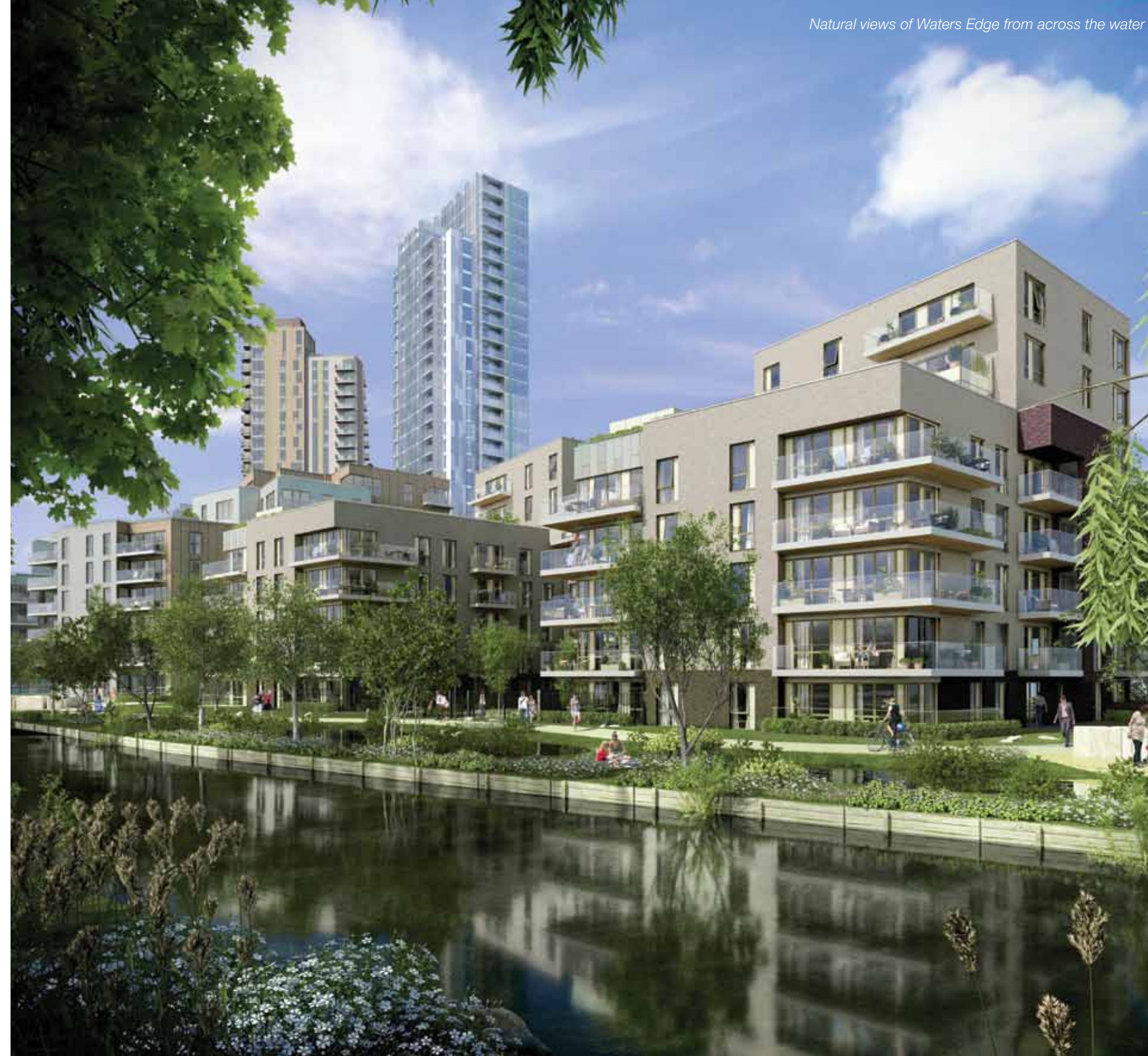
Natural views of Waters Edge from across the water

Residents will benefit from 24 hour concierge with enhanced security through the use of electronic entry keypads ensuring peace of mind.