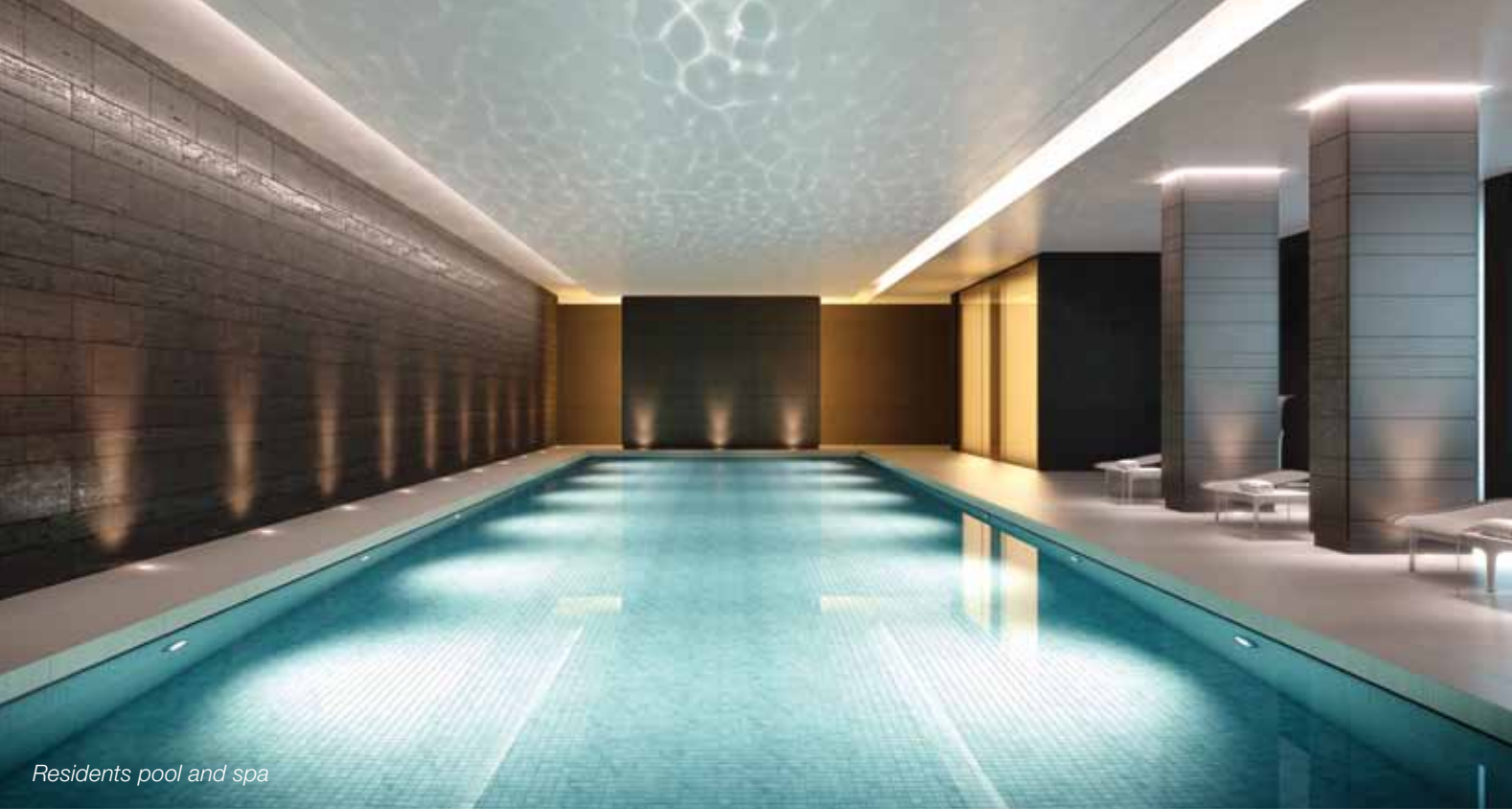
Residents pool and spa