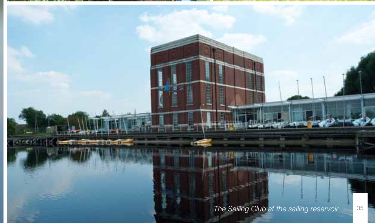
The Sailing Club at the sailing reservoir