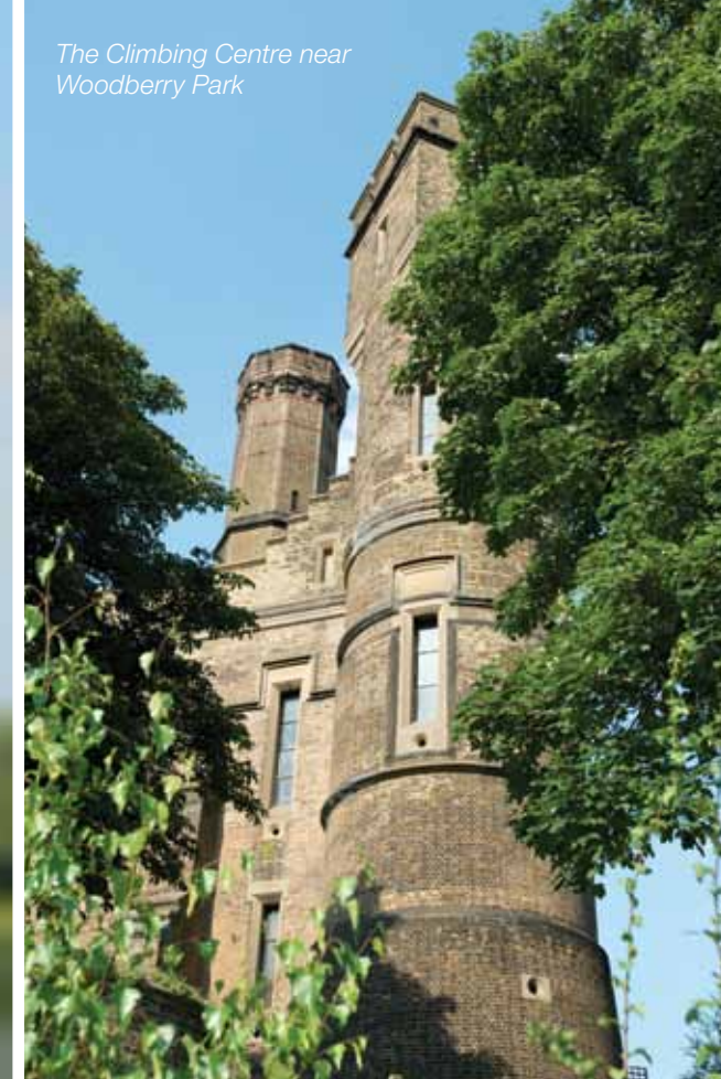
The Climbing Centre near Woodberry Park