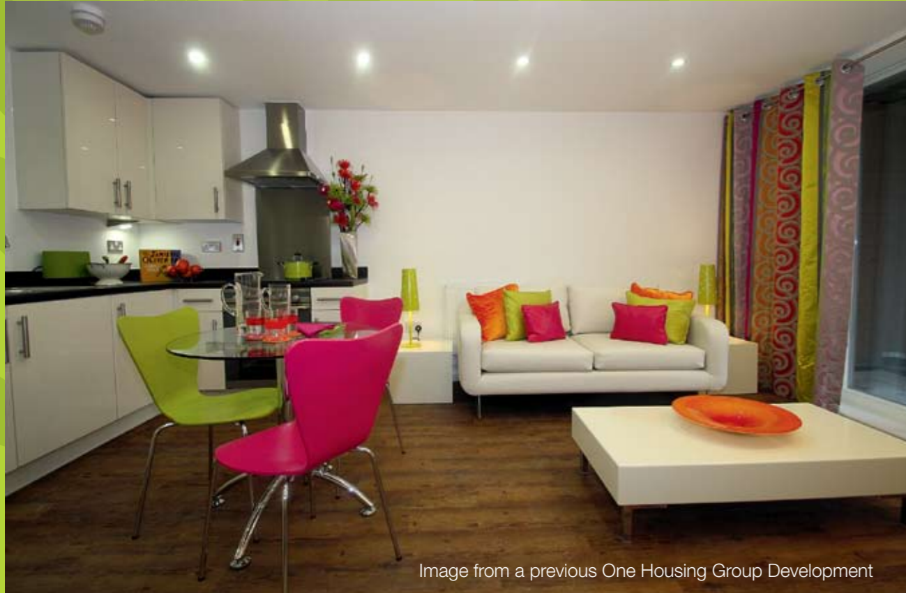
Image from a previous One Housing Group Development