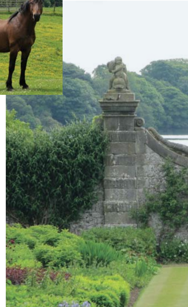
Loch Leven Castle from the Gardens of Kinross House

Steeped in history, the well preserved ruins of Loch Leven Castle sits on Castle Island and can be reached by boat during the summer months. The castle is perhaps best known as a place of imprisonment for Mary, Queen of Scots and where she was forced to abdicate in favour of her infant son, James VI.