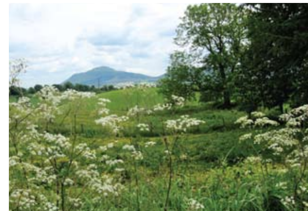
Lomond Hill from fields at Upper Tillyrie