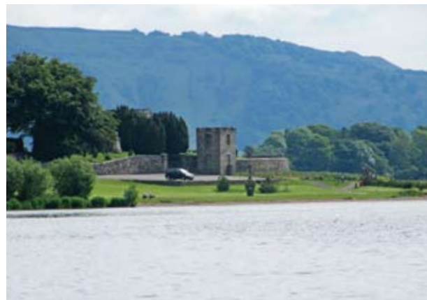
Loch Leven Castle

Muir Homes is a family business and Gamekeeper's View has been chosen with the family in mind. Small and exclusive, there is a choice of three, four and five bedroom homes, with generous grounds in a glorious location.