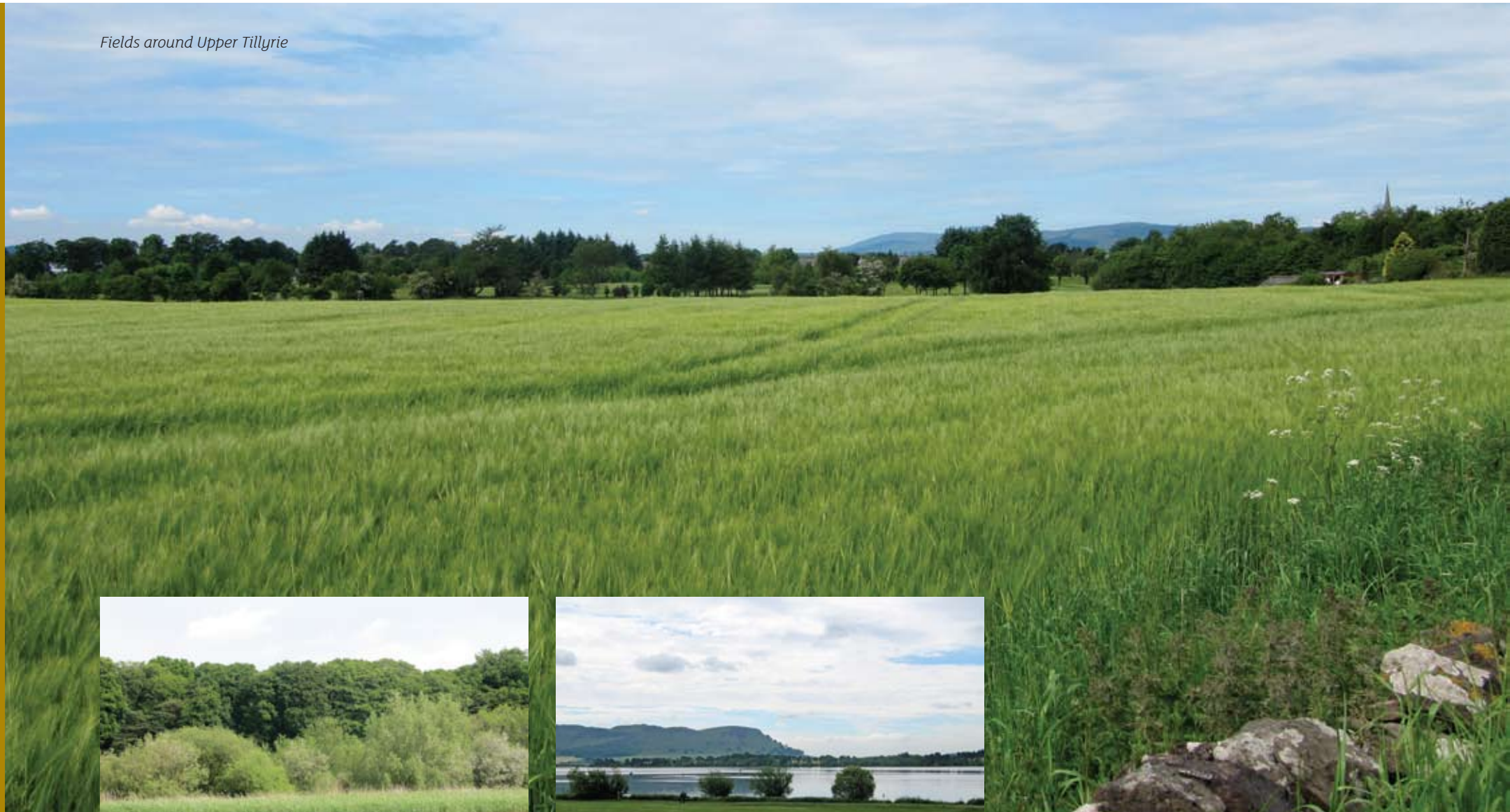
Fields around Upper Tillyrie