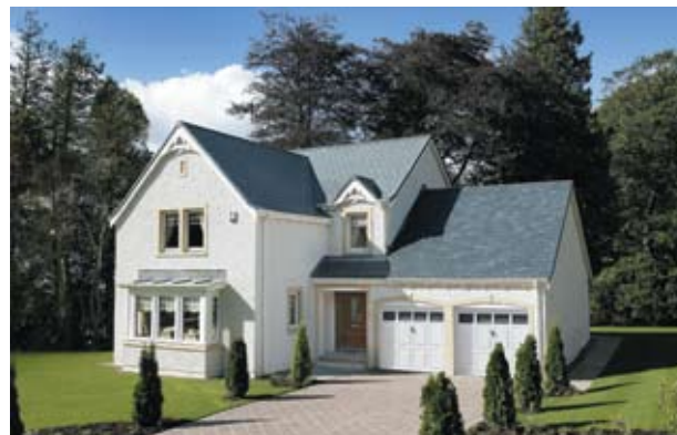
Typical Muir Homes exterior

Muir Homes has a strong commitment to environmental principles, demonstrated by the inclusion of sustainable materials in the construction of our homes. Our family homes feature high quality specification including our natural wood hallmark finishes.