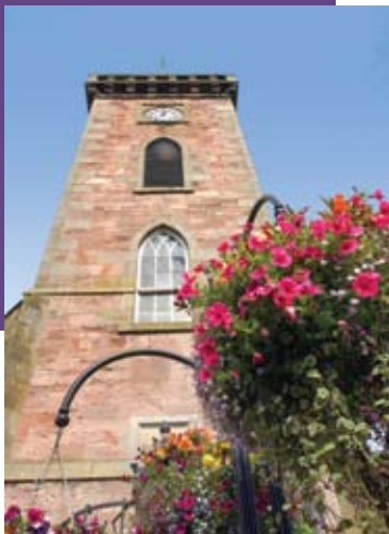
Milnathort Town Hall