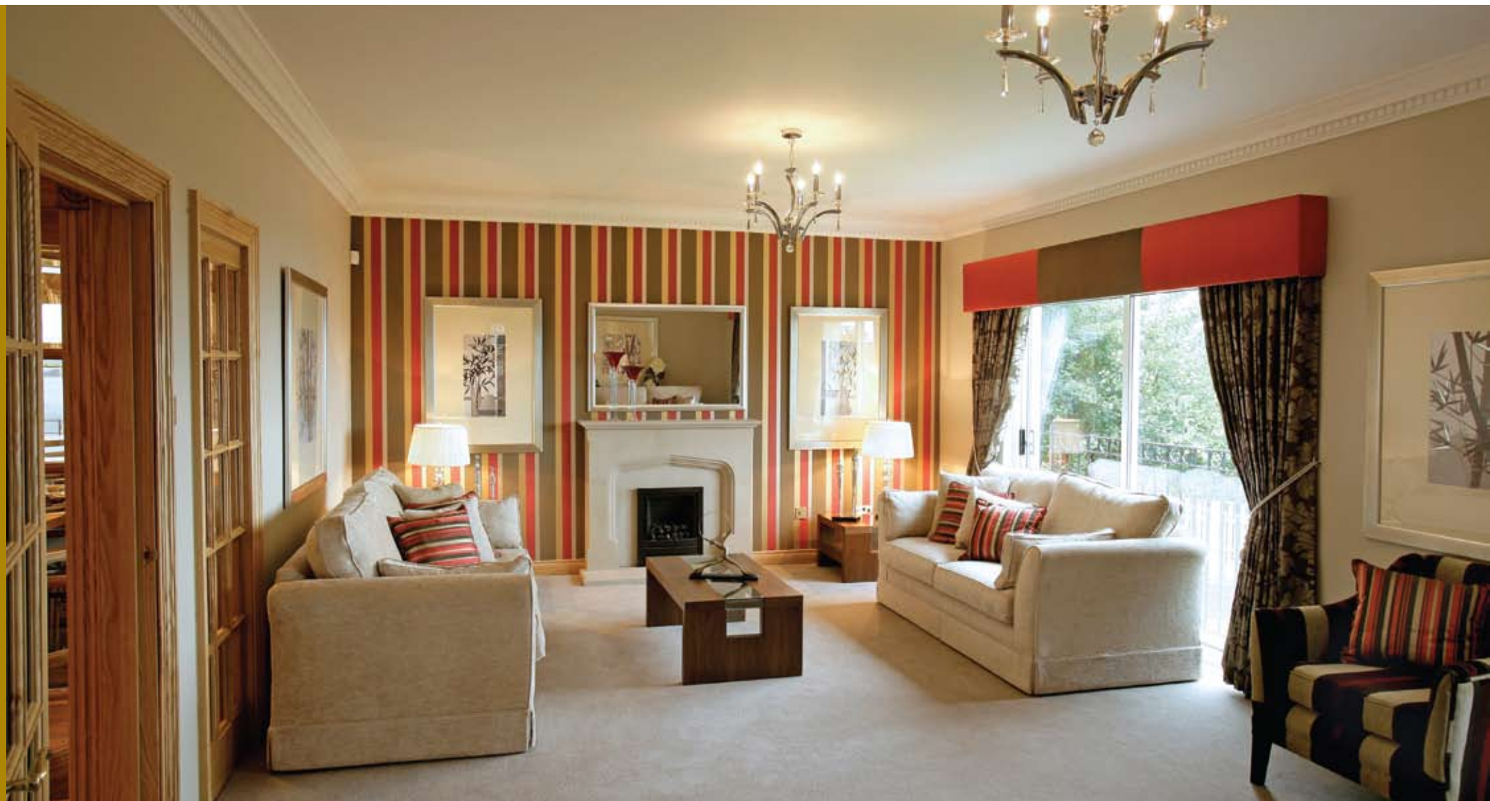
Typical Muir Homes lounge