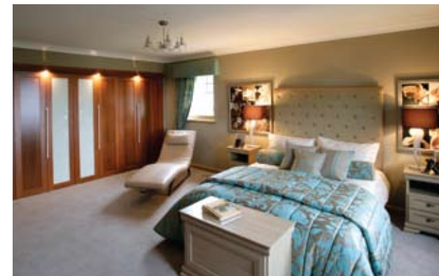
Typical Muir Homes bedroom