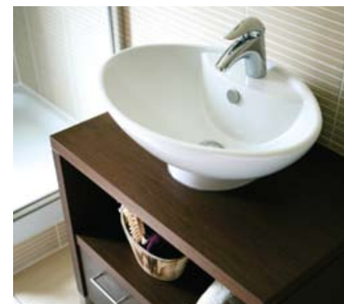
Typical Muir Homes interiors