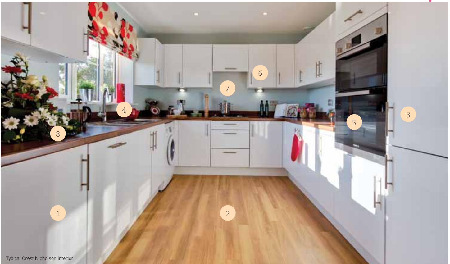
Typical Crest Nicholson interior

In addition to a comprehensive specification, Crest Nicholson will enable you to personalise your new home with a choice of kitchens, flooring and tiling.