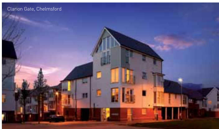
Clarion Gate, Chelmsford

At Crest Nicholson we continue to build attractive new homes that satisfy our customer's needs, whilst successfully combining classic design and construction techniques with the use of sustainable materials and state-of-the-art technology.