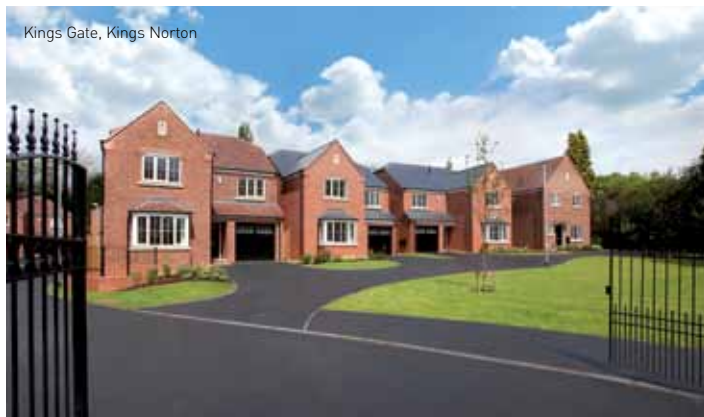
Kings Gate, Kings Norton