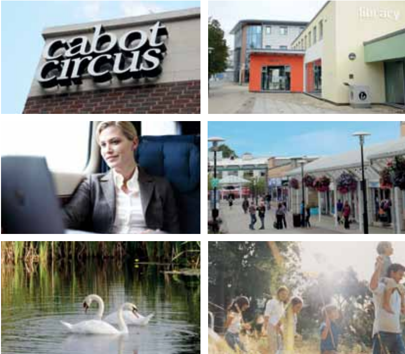
Photography taken in and around Yate, Chipping Sodbury and Bristol.

“Yes Bristol and Bath are on your doorstep, but for everyday amenities, Yate has a superb number of ‘High Street’ brands situated between Tesco Extra and the Leisure Centre. In Yate convenience counts.”