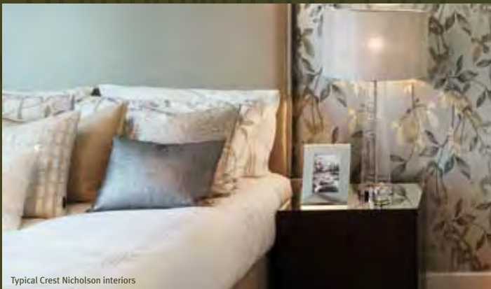
Typical Crest Nicholson interiors