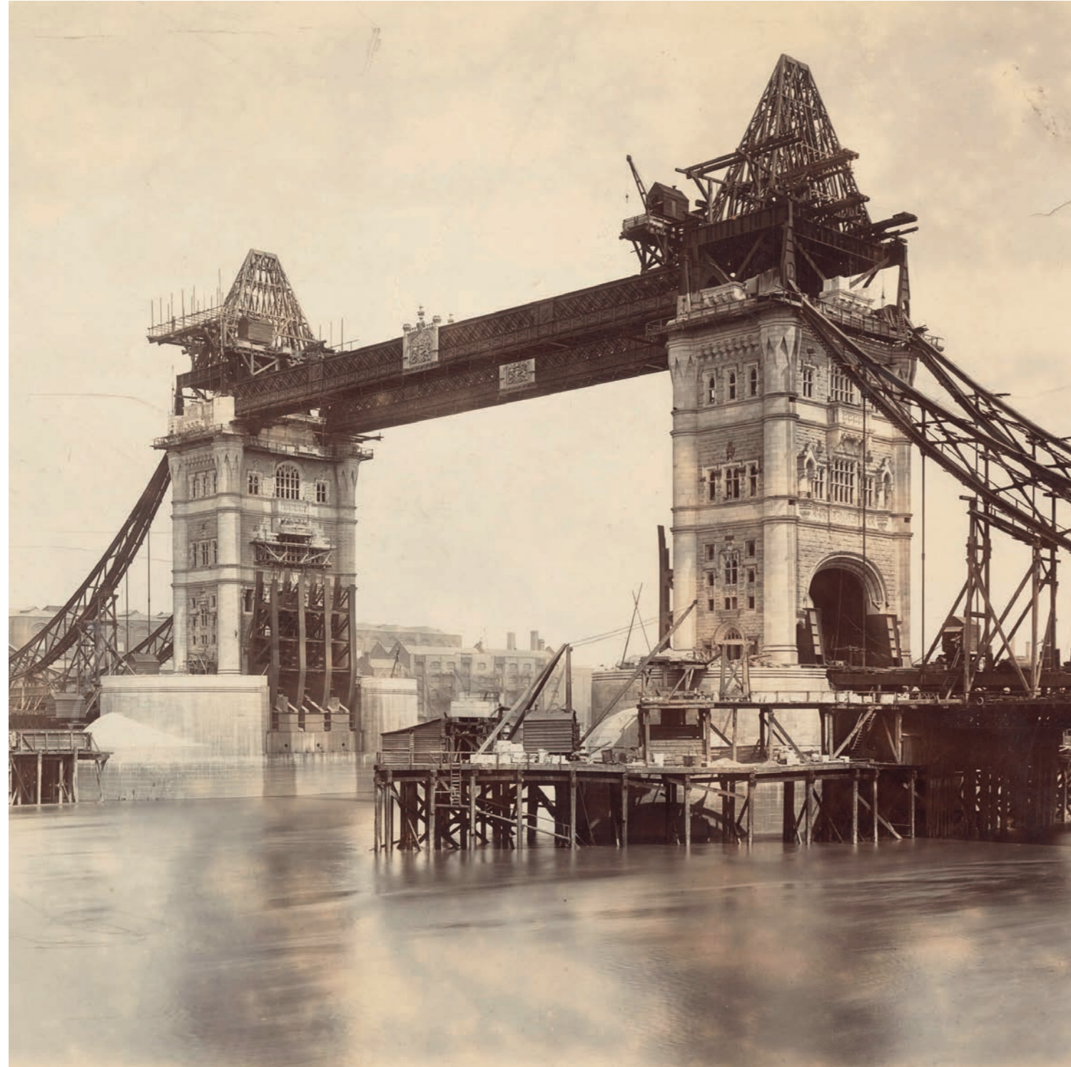
Circa 1893: Tower Bridge and the Thames.