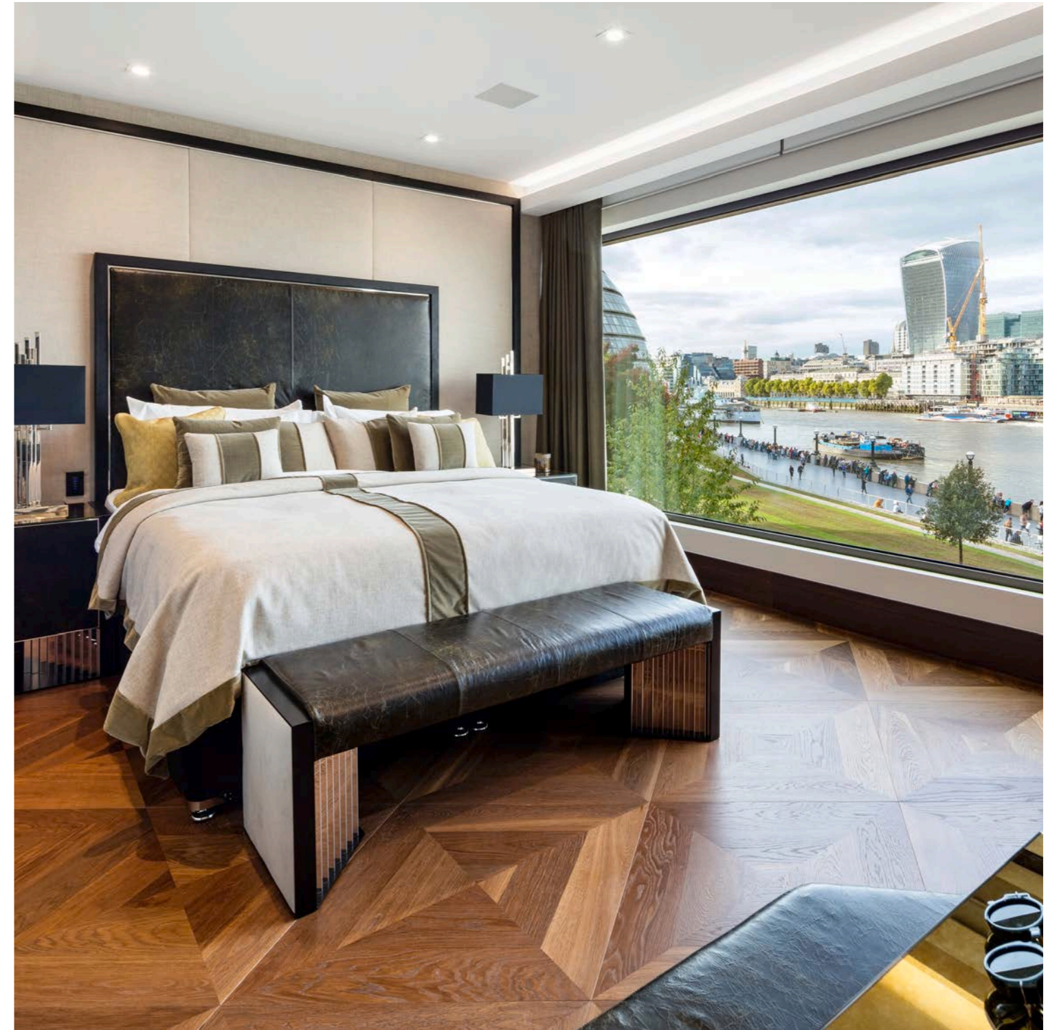
Photograph depicts interiors and specification of show home. Refer to the specification for individual apartments' particulars.