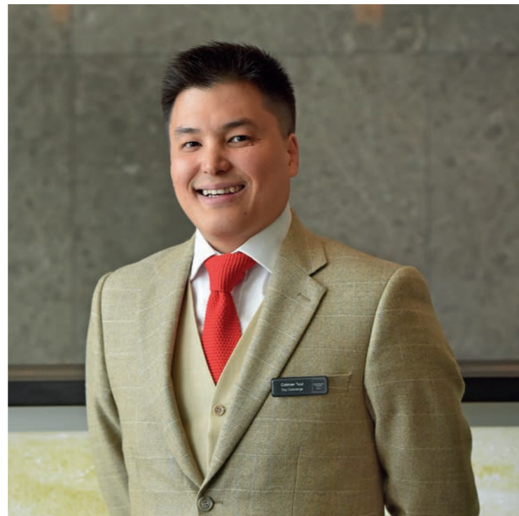
Clockwise from top left: Spa, Health Club, Harrods concierge, Business Lounge.