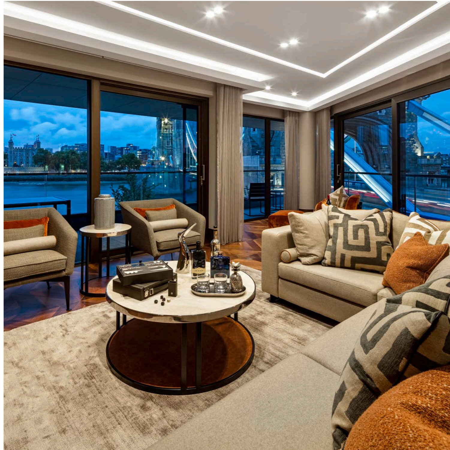
Photograph depicts interiors and specification of show home. Refer to the specification for individual apartments' particulars.