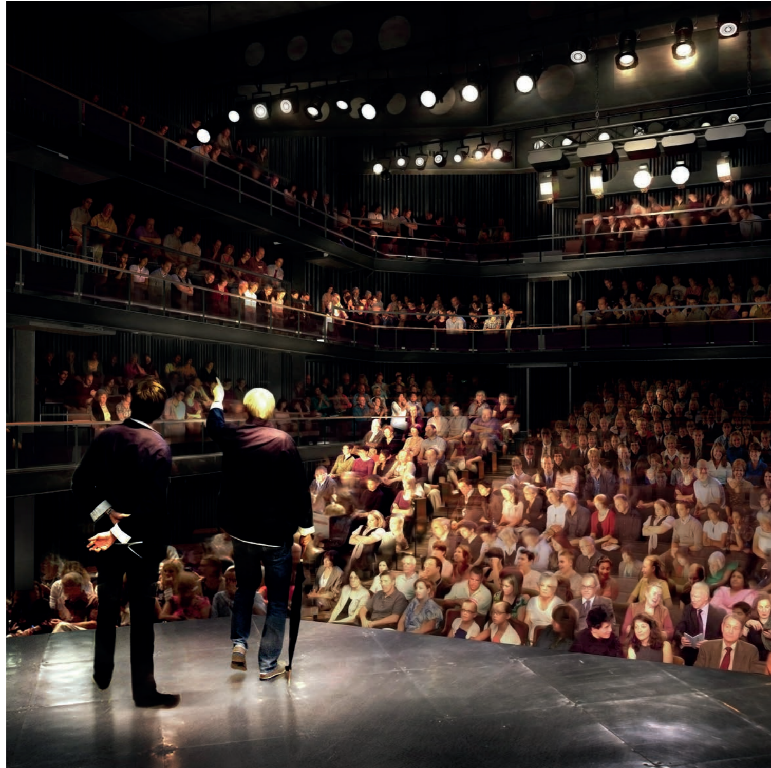
Computer generated image of the 900 seat modern auditorium, indicative only.