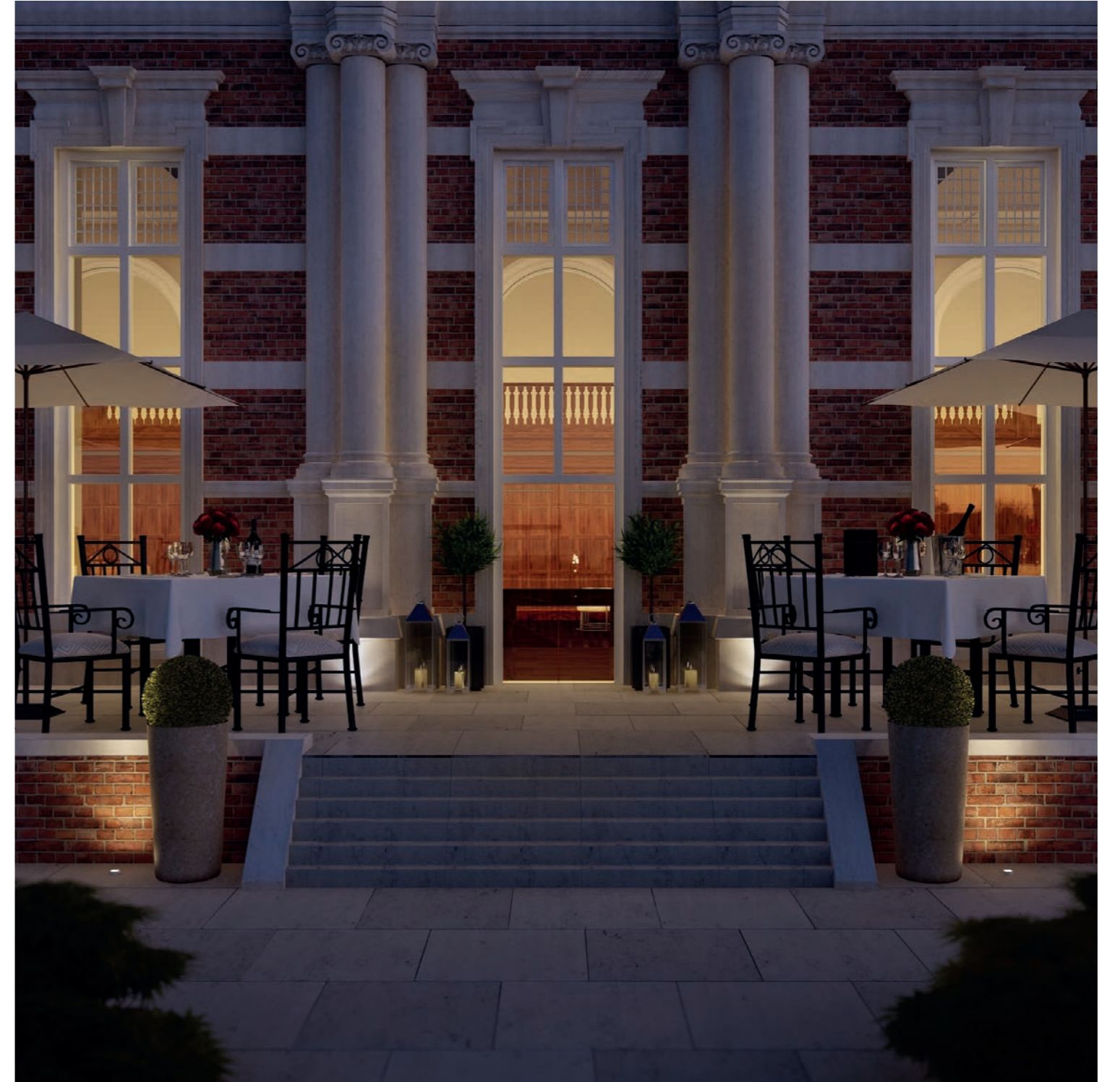
Computer generated images of the Lalit London Hotel, indicative only.

Residents will also benefit from a new luxury Lalit London Hotel, located in the beautiful refurbished Grade II listed St Olave's Grammar School which includes a destination restaurant and 70 boutique hotel rooms.