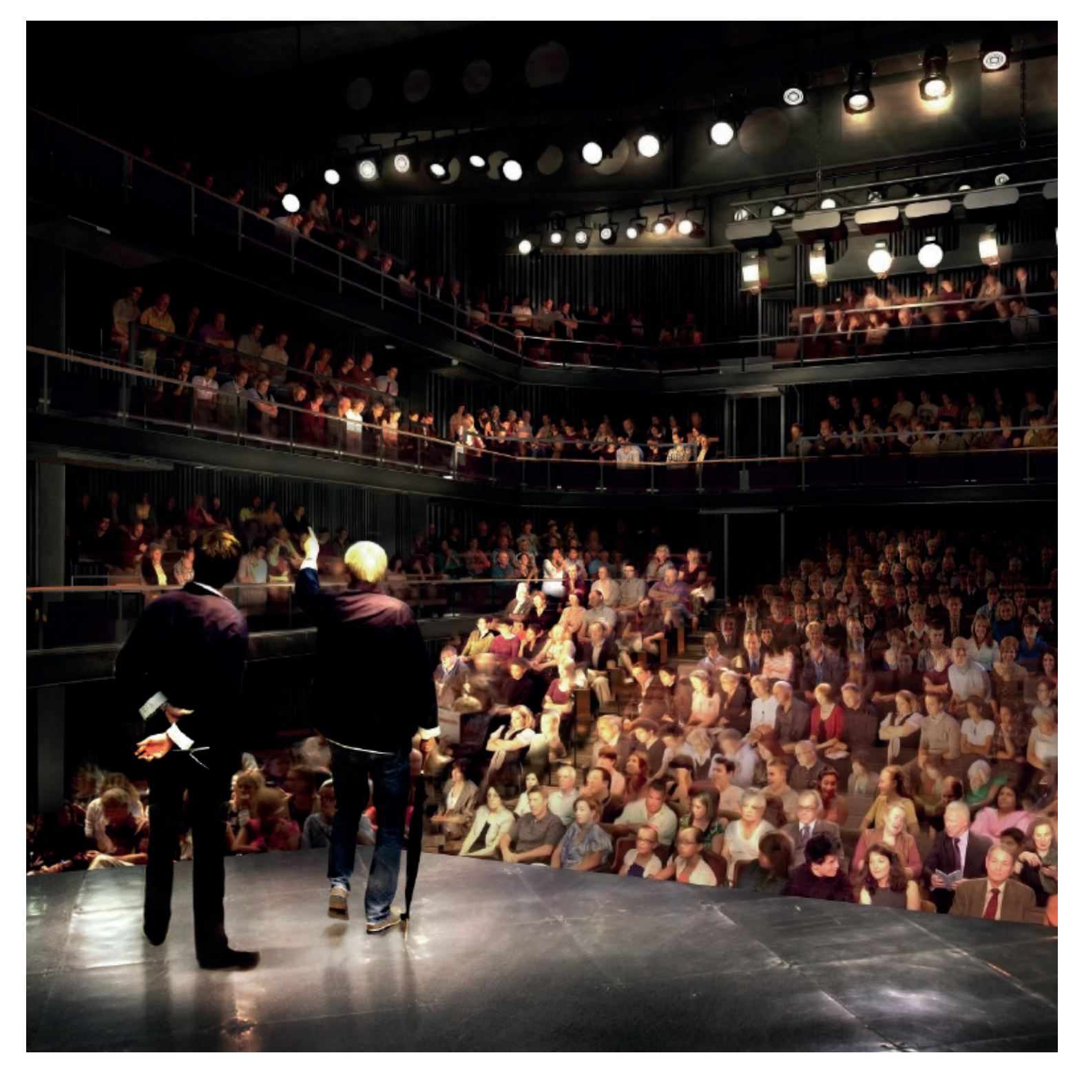
Computer generated image of the 900 seat modern auditorium, indicative only.