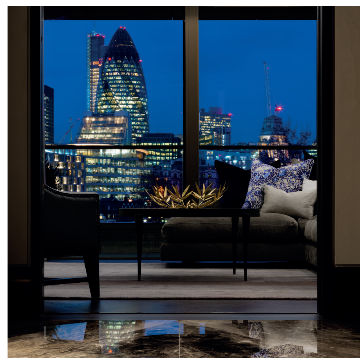
Photograph depicts interiors and specification of show home. Refer to the specification for individual apartments' particulars.