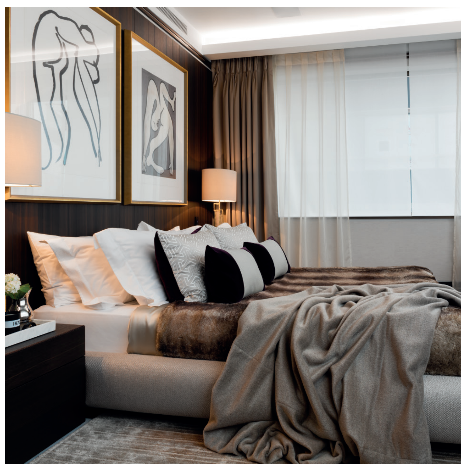
Photograph depicts interiors and specification of show home. Refer to the specification for individual apartments' particulars.