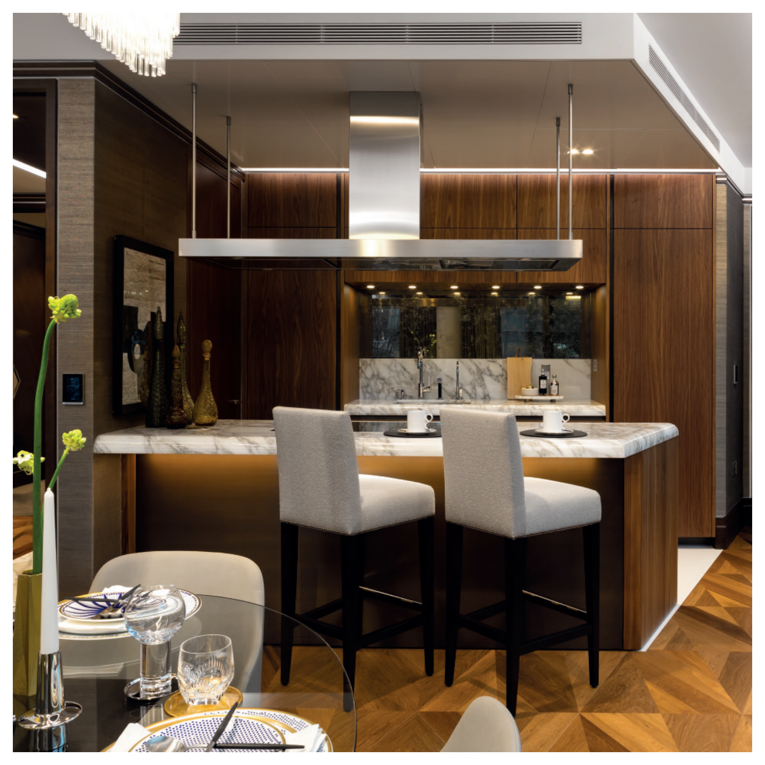
Photograph depicts interiors and specification of show home. Refer to the specification for individual apartments' particulars.