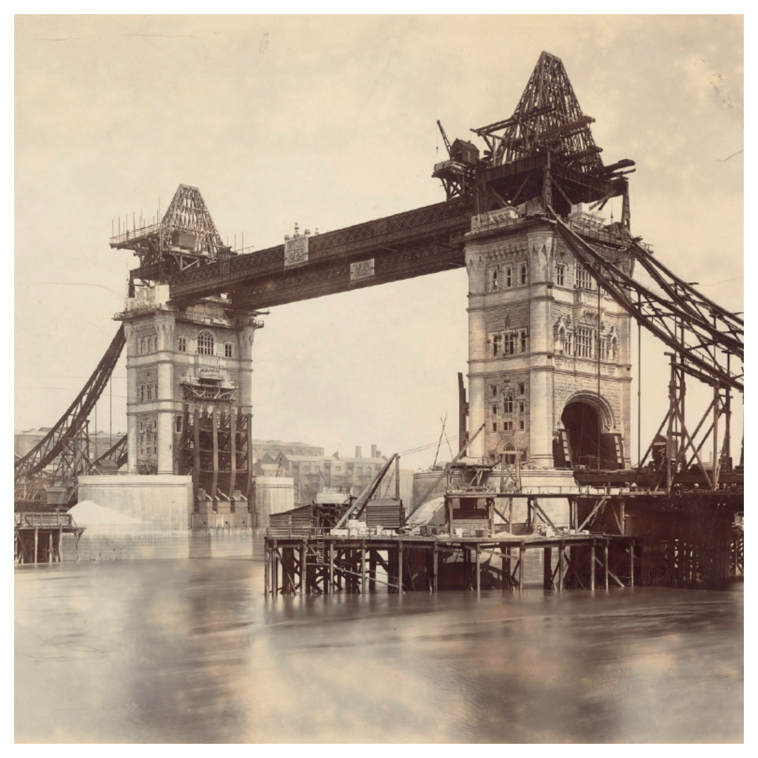
Circa 1893: Tower Bridge and the Thames.