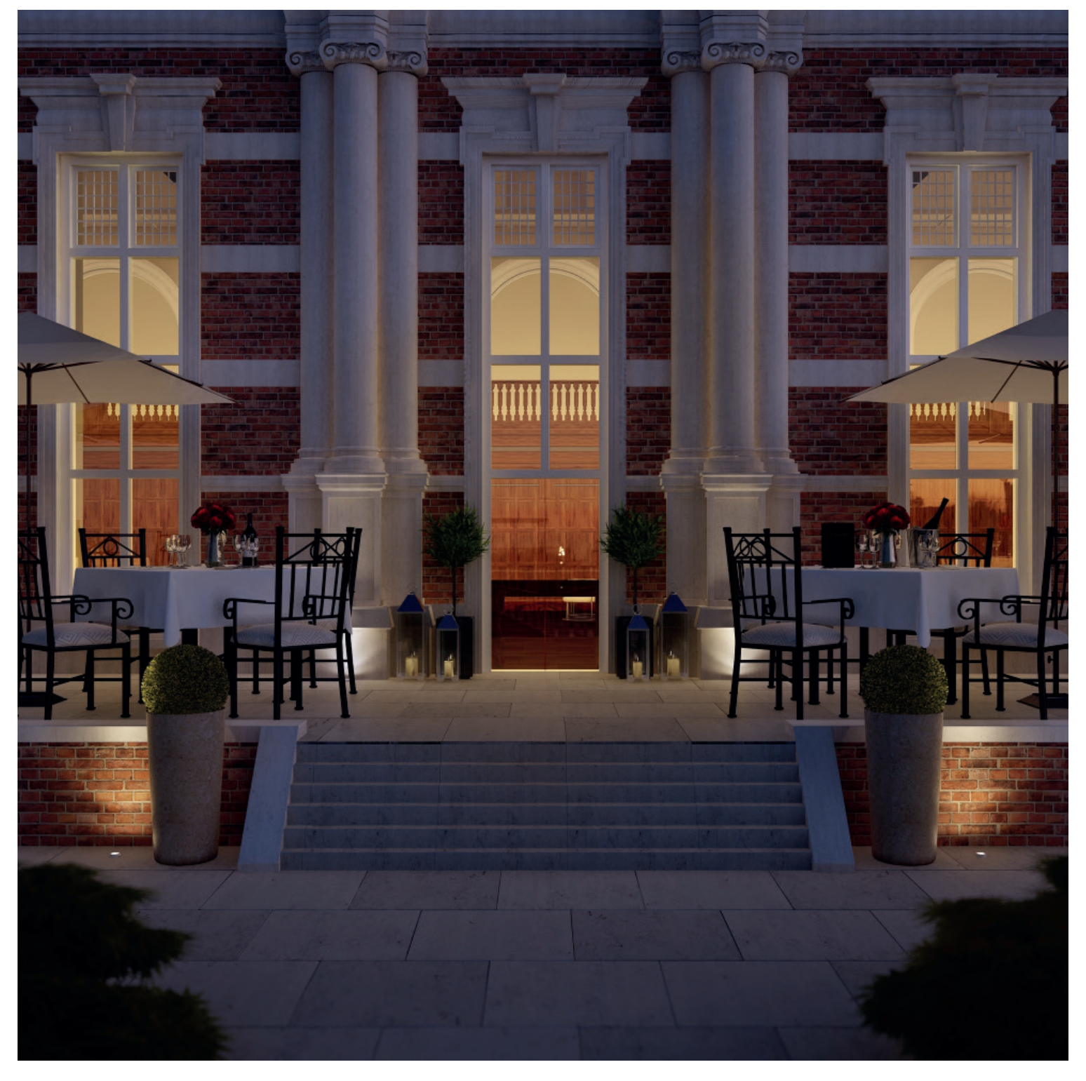
Computer generated images of the Lalit London Hotel, indicative only.

Residents will also benefit from a new luxury Lalit London Hotel, located in the beautiful refurbished Grade II listed St Olave's Grammar School which includes a destination restaurant and 70 boutique hotel rooms.