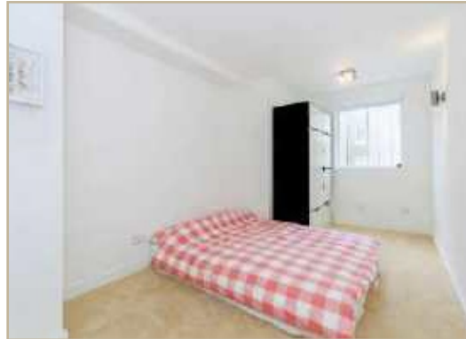
Milford House Approx. Gross Internal Area 830 Sq Ft - 77.11 Sq M