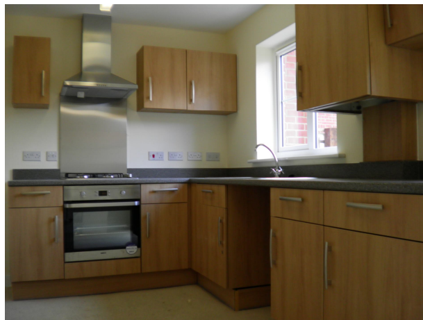
Typical kitchen in houses

A selection of homes available in Ipswich for shared ownership purchase.