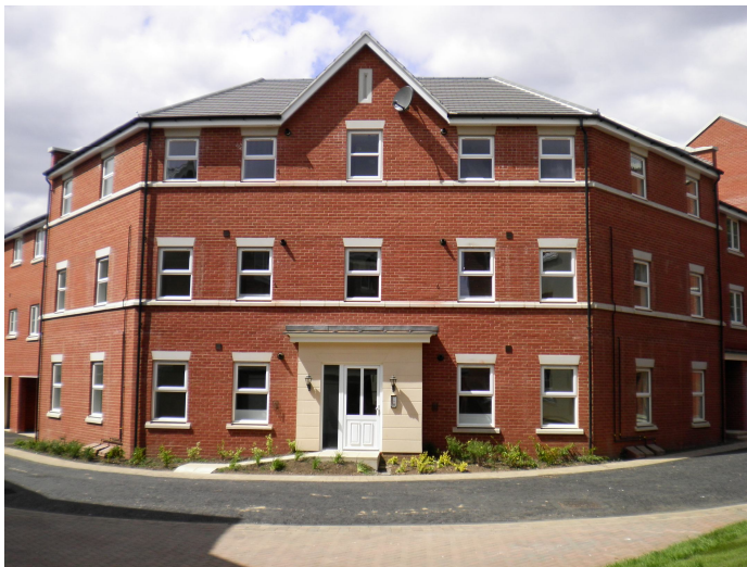
Typical apartments at Vista

£500 paid towards legal fees on completion