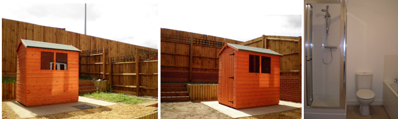
Typical gardens and bathroom of houses

You must confirm to us your registration numbers.