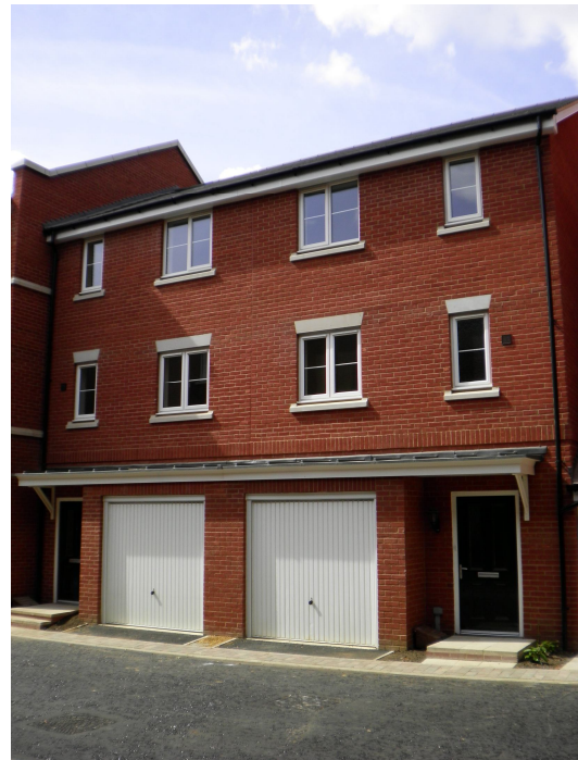
Typical exterior for Meridian Rise