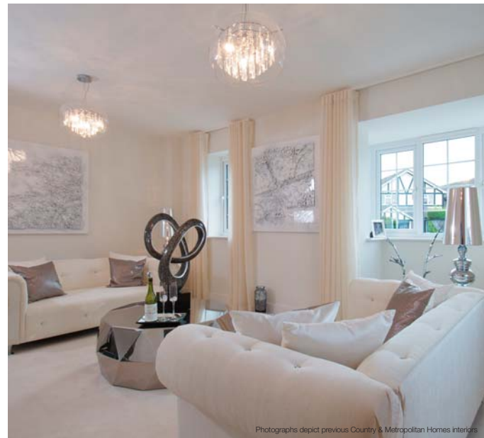
Photographs depict previous Country & Metropolitan Homes interiors

Beautiful to live in and kind to the environment too, with low energy light fittings just one of many eco-friendly features and with every property in this exciting new development having a 10 year NHBC warranty peace of mind is guaranteed. Lower energy bills and a higher standard of living are yours to enjoy at Bluebells.