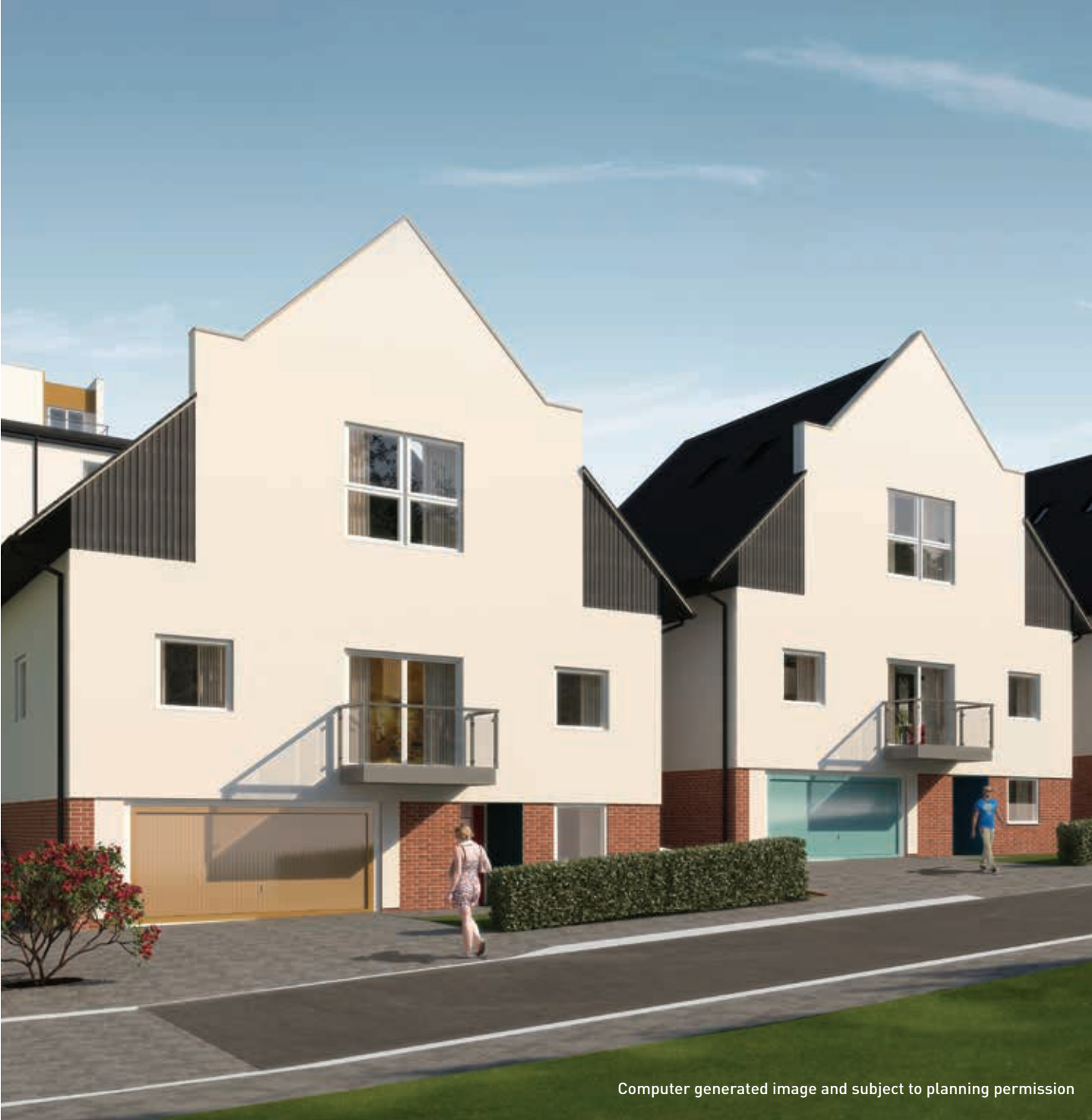
Computer generated image and subject to planning permission