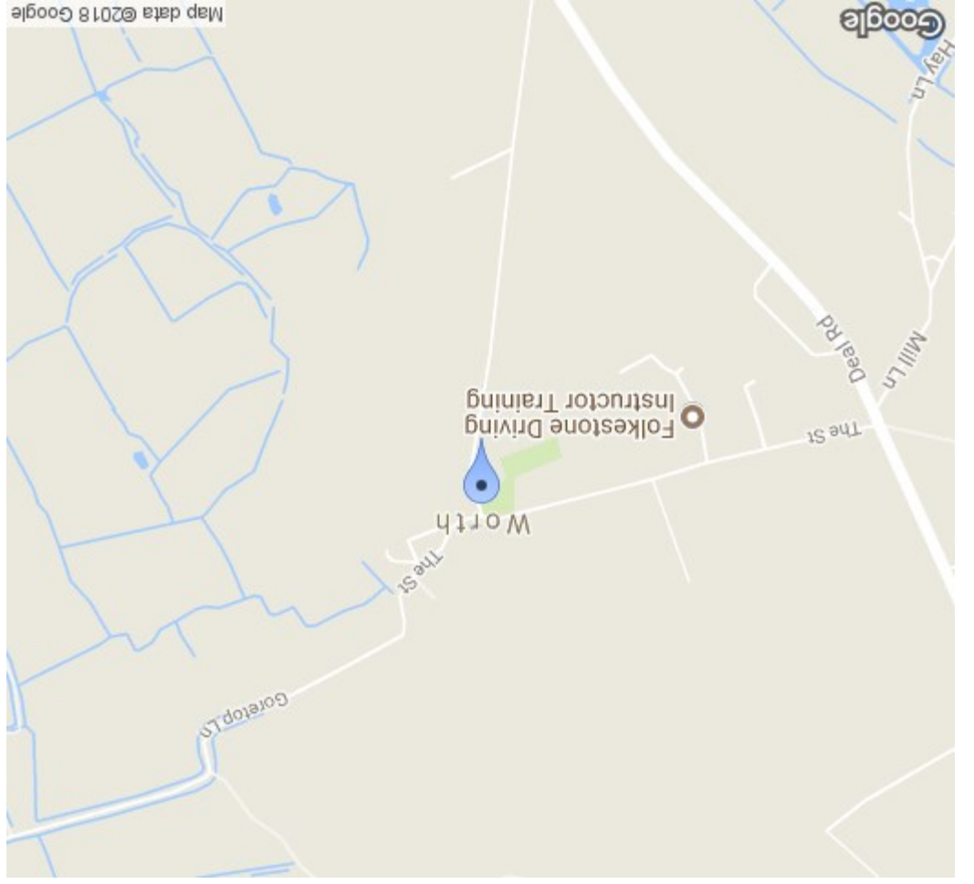
PLOT 2 CHURCHFIELD JUBILEE ROAD WORTH