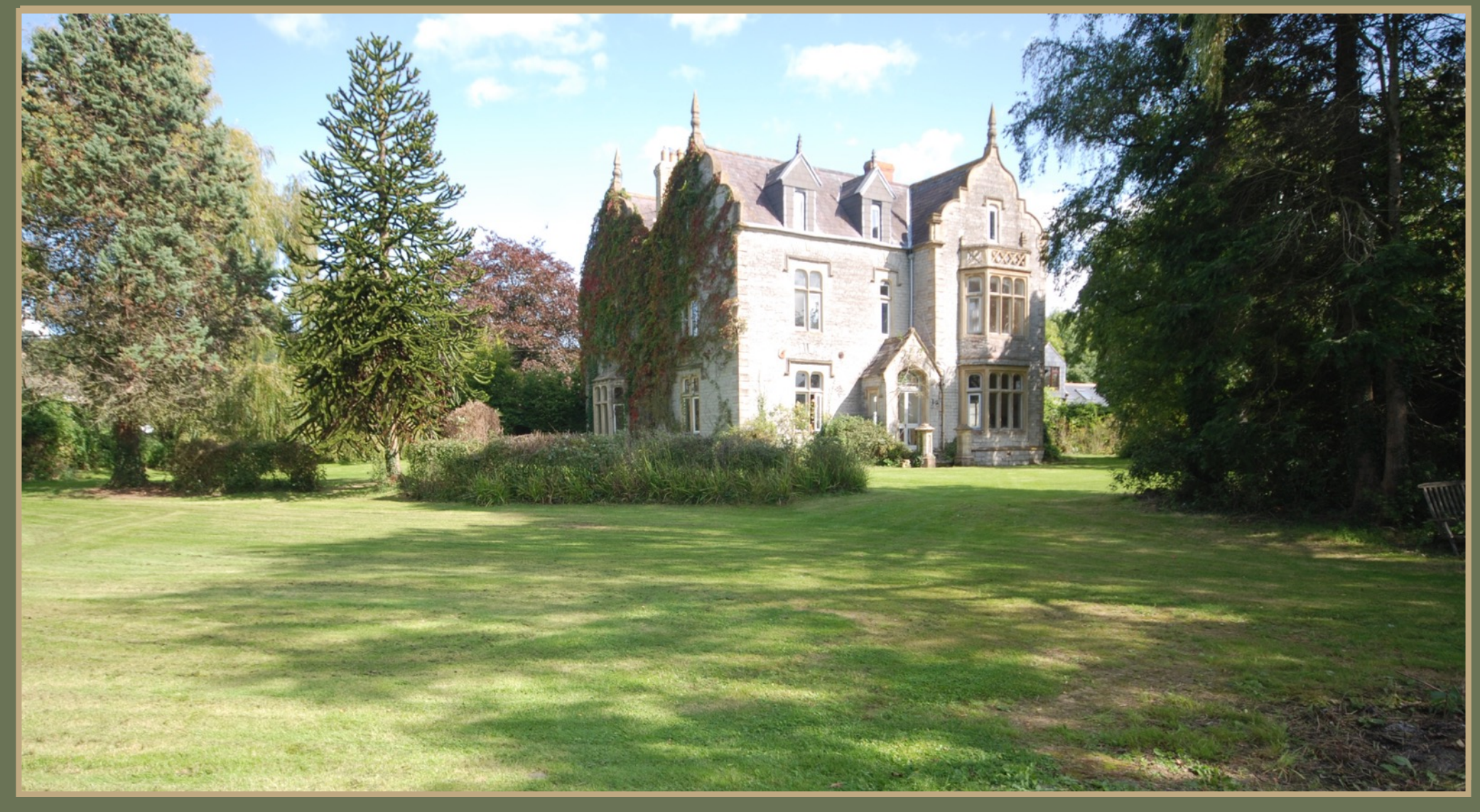
THE ELMS, BREECH LANE, WEST PENNARD, GLASTONBURY, BA6 8NP