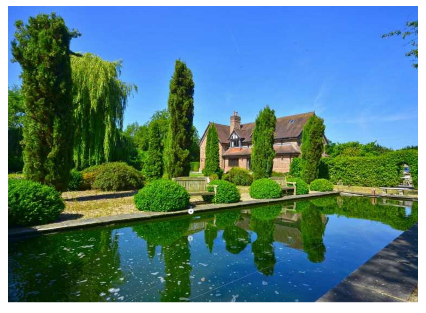
Cockaynge, Loudwater Lane, Rickmansworth, WD3 4AL