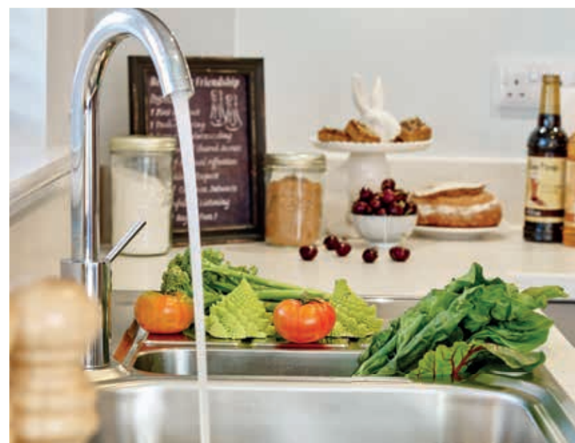
Typical Crest Nicholson show home interiors shown