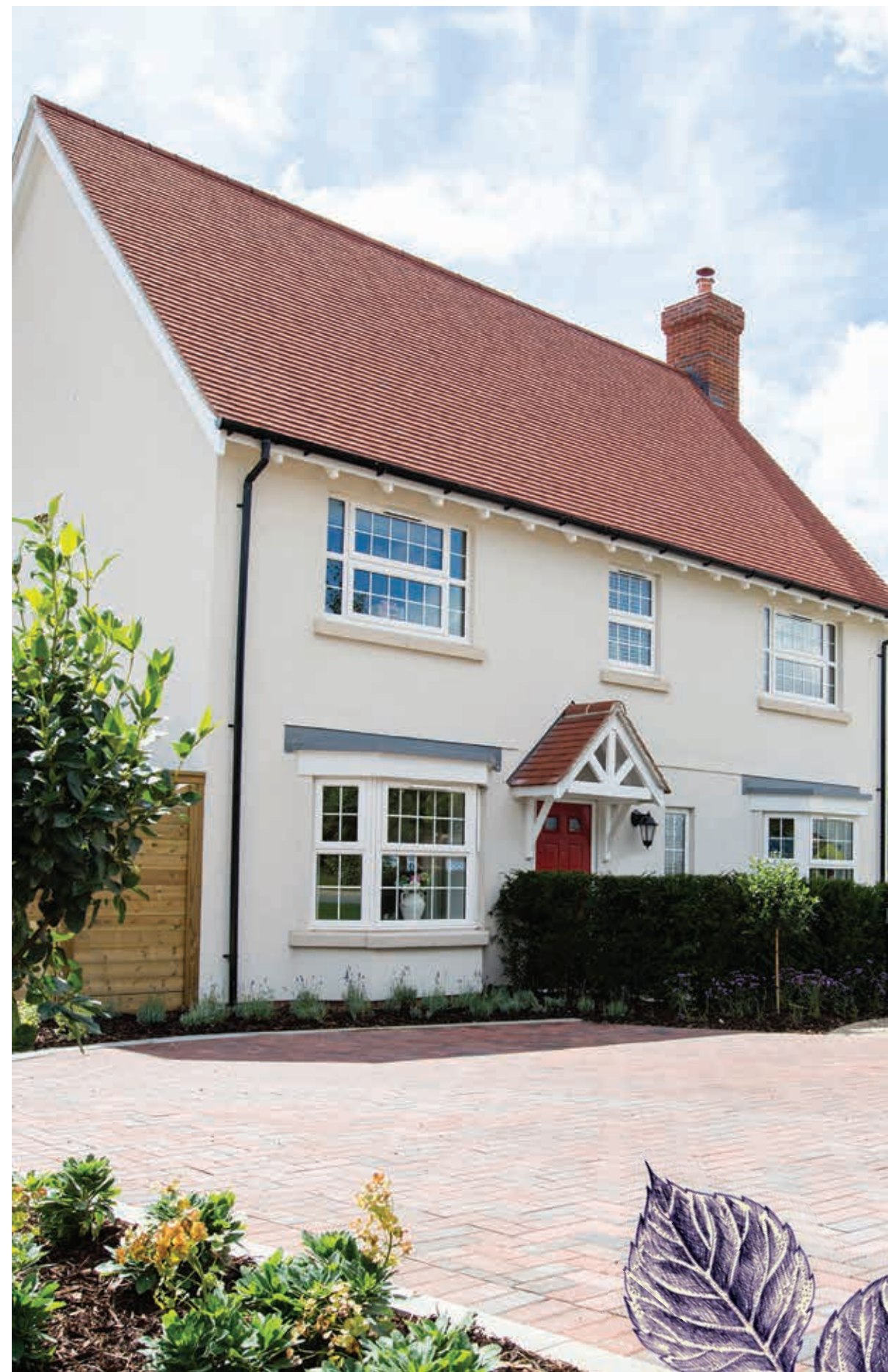
Elsenham Vale, Elsenham

Our commitment to building exemplary new homes and creating sustainable communities is recognised in our impressive array of industry design awards, including more CABE Gold Building for Life Awards than any other developer. This continues to reinforce both our success in the design and delivery of attractive, sustainable new homes and our position as one of the UK's leading developers. Small wonder that the discerning homebuyer appreciates the difference to be enjoyed in a Crest Nicholson home.