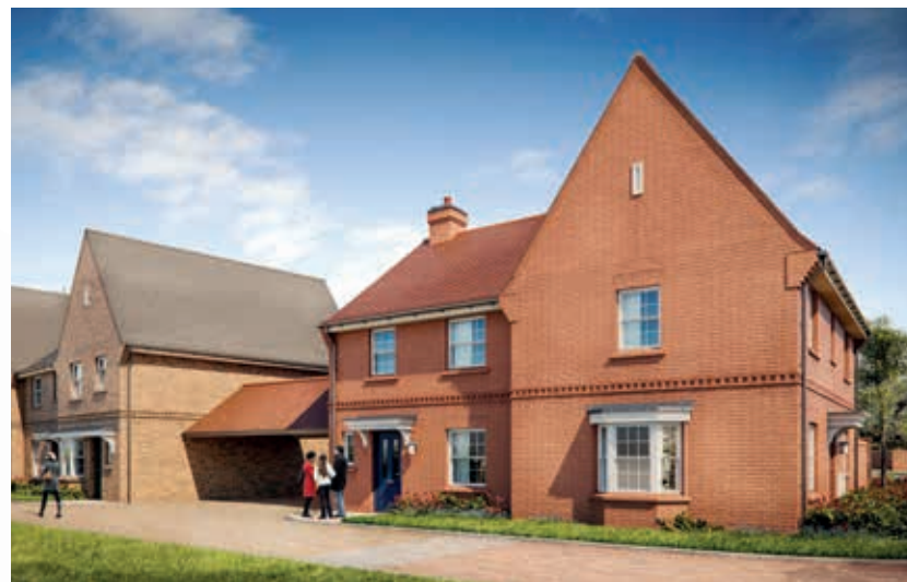
Digital illustration is indicative only