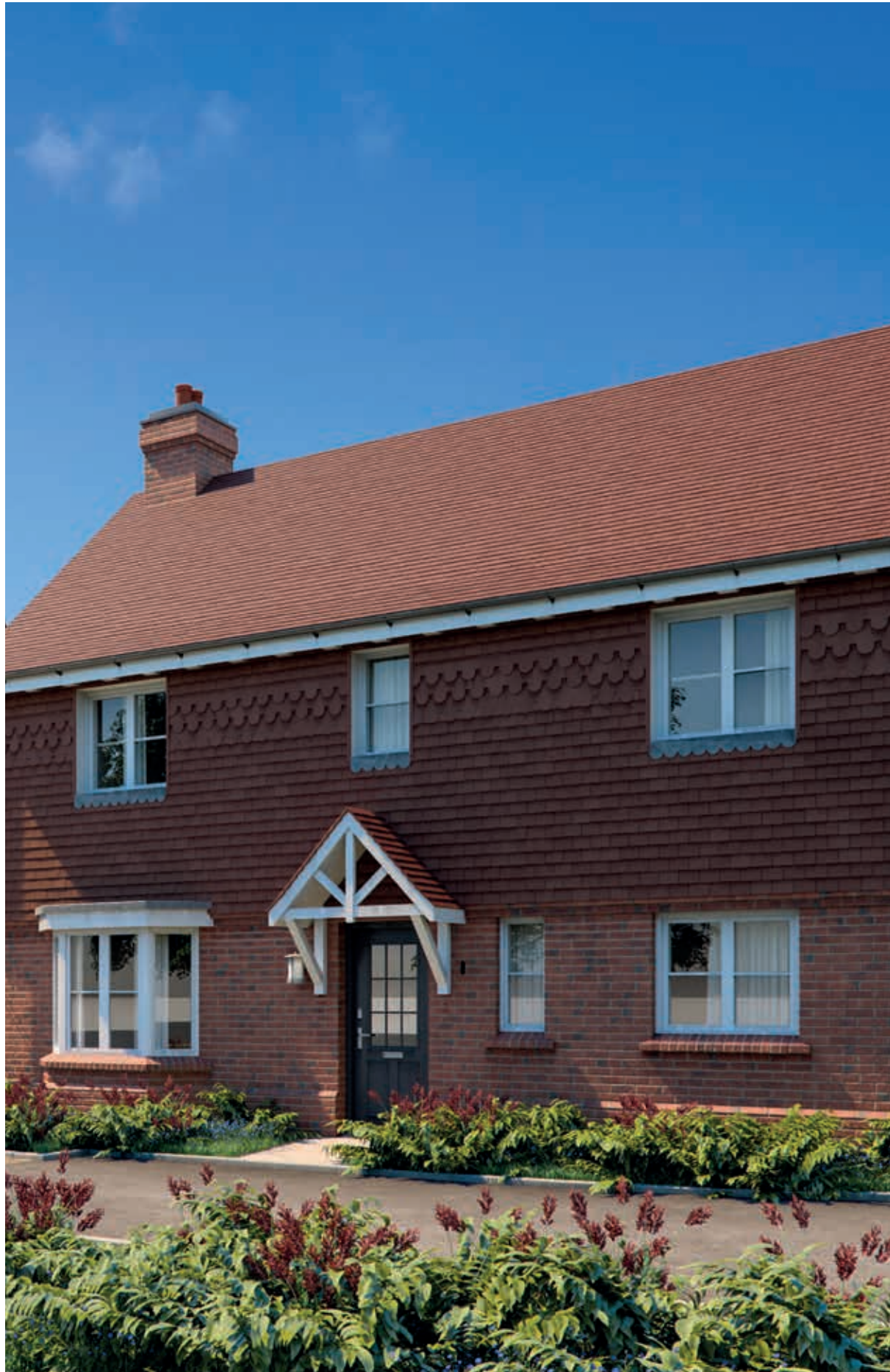
Digital illustration is indicative only