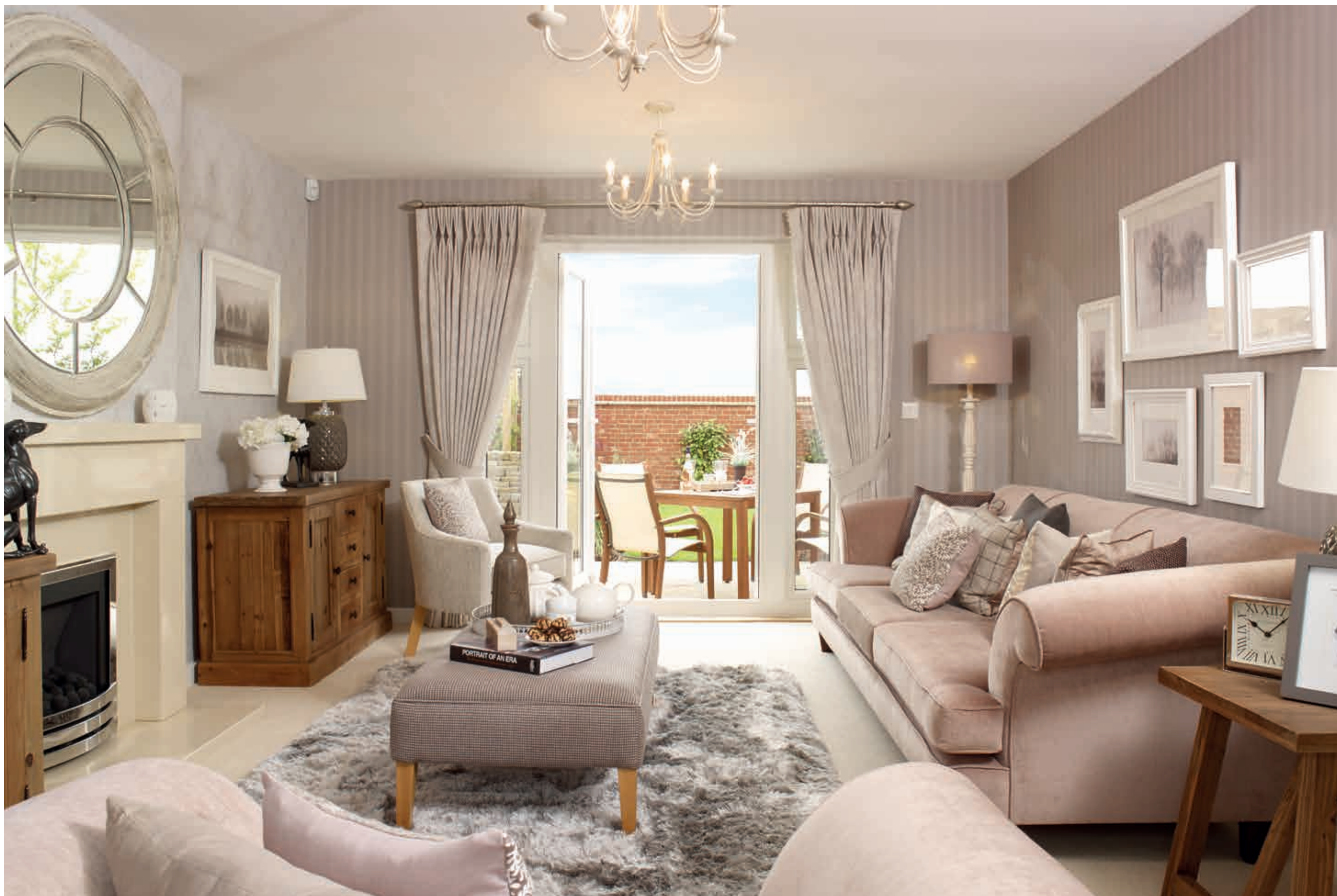
Typical Crest Nicholson show home interiors shown