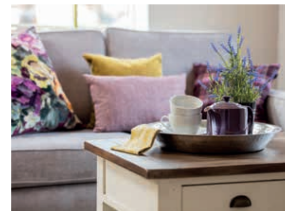
Typical Crest Nicholson show home interiors shown