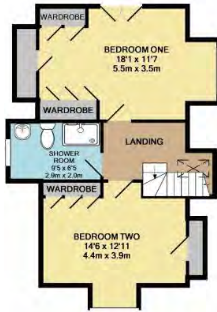
1ST FLOOR APPROX. FLOOR AREA 595 SQ.FT. (46.9 SQ.M.)