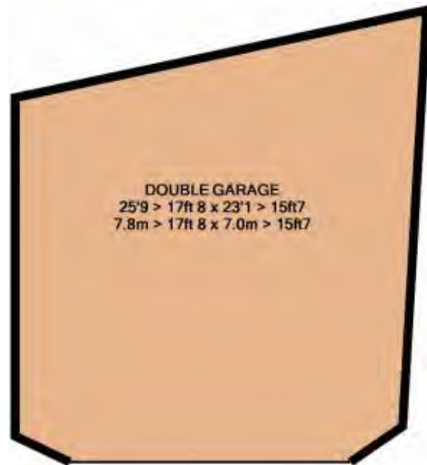
DOUBLE GARAGE APPROX. FLOOR AREA 480 SQ.FT. (44.6 SQ.M.)