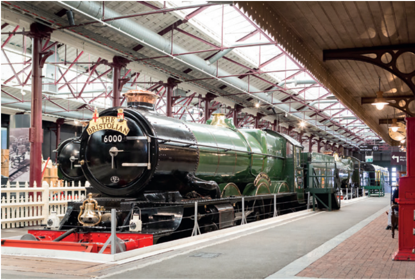
Photo: courtesy of STEAM - Museum of the GWR and featuring locomotives on loan from the National Railway Museum.