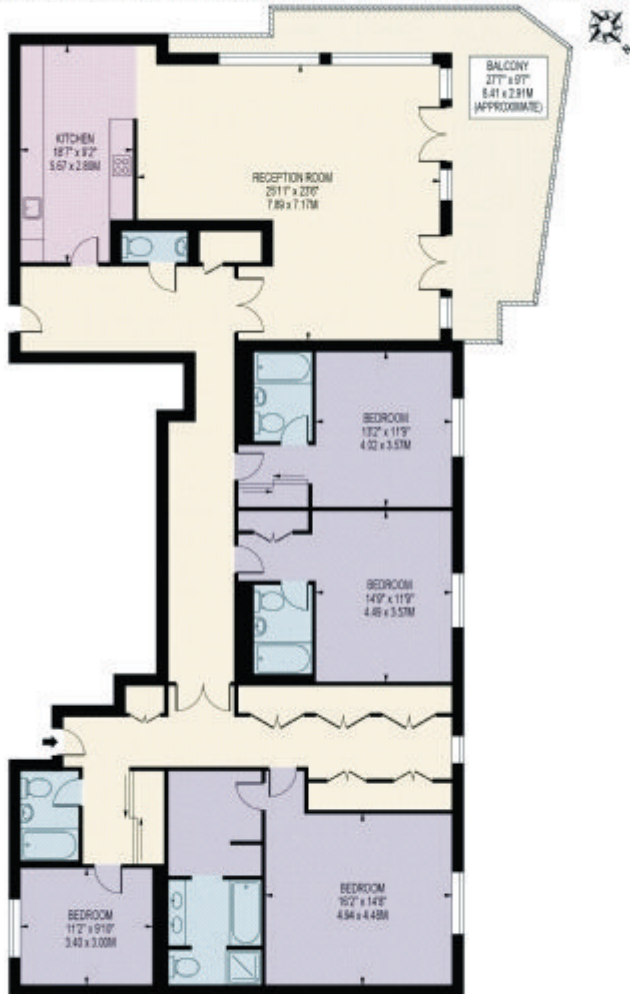
ELEVENTH FLOOR FOR ILLUSTRATION PURPOSES ONLY

APPROXIMATE GROSS INTERNAL FLOOR AREA: 2601 SQ FT - 241.63 SQ M