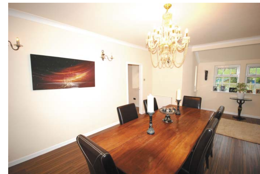
Below Formal dining room; garden room with sea views and access to outdoor deck