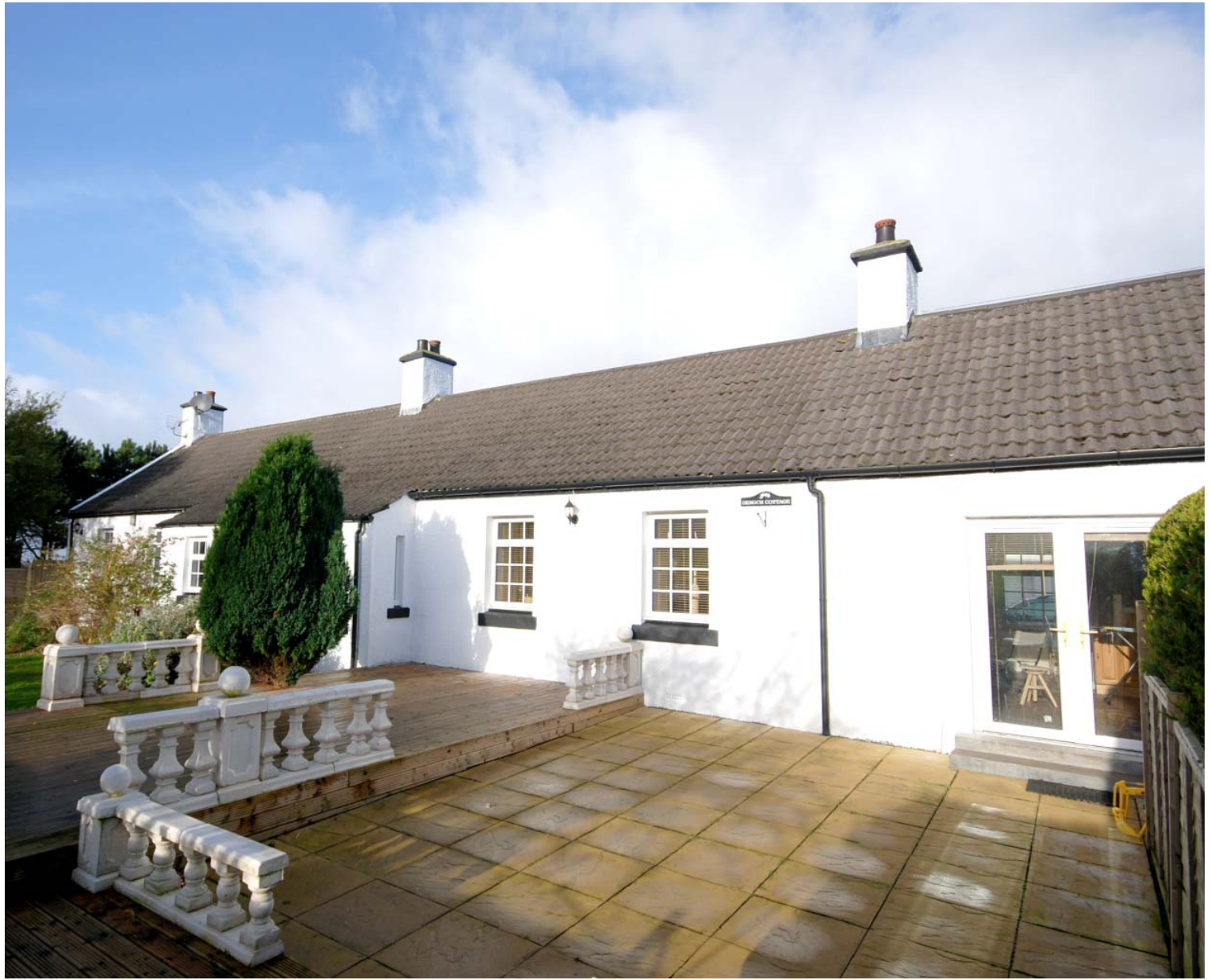
Genoch Cottage, By Ayr