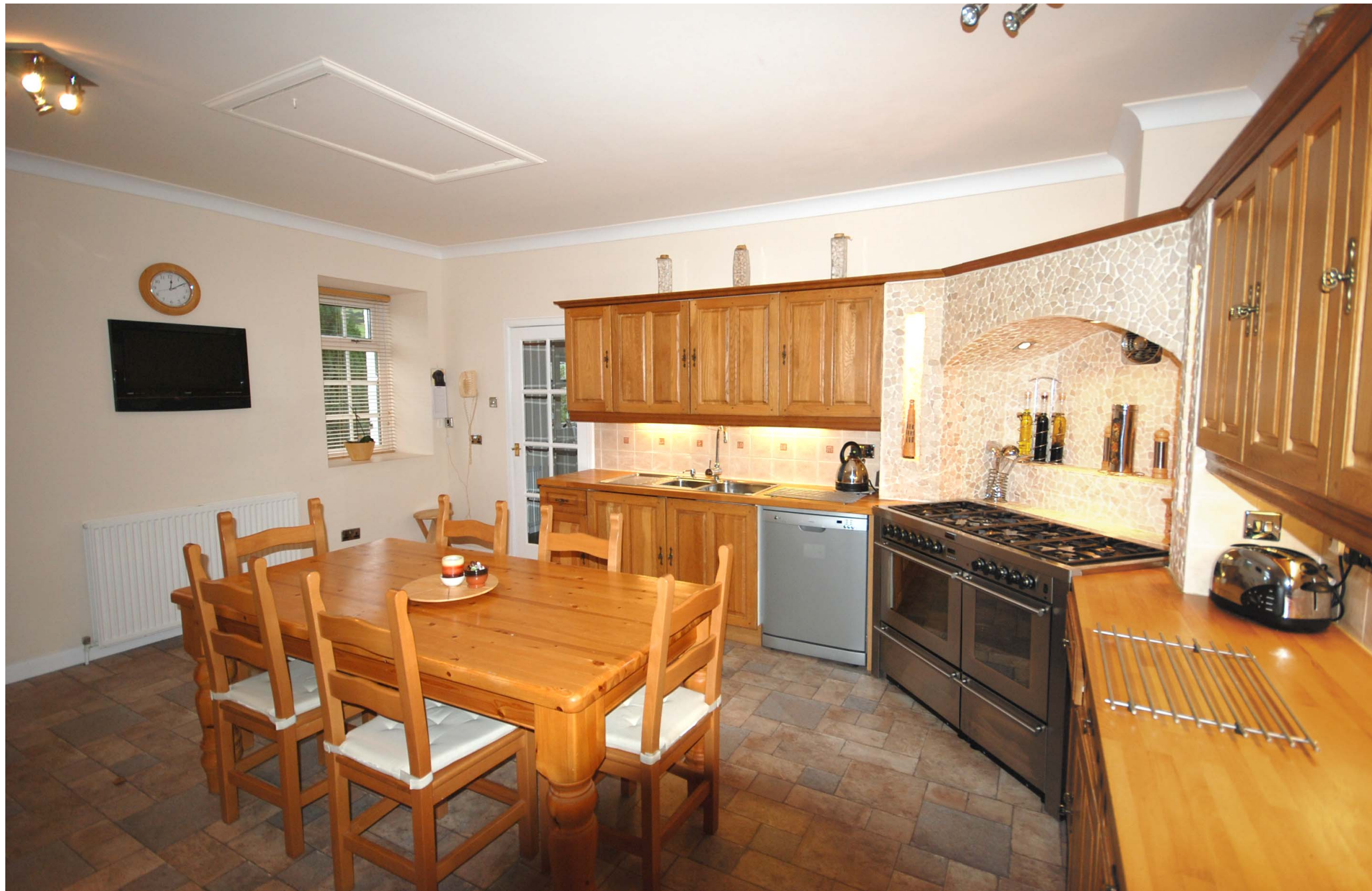
Left Stunning dining kitchen