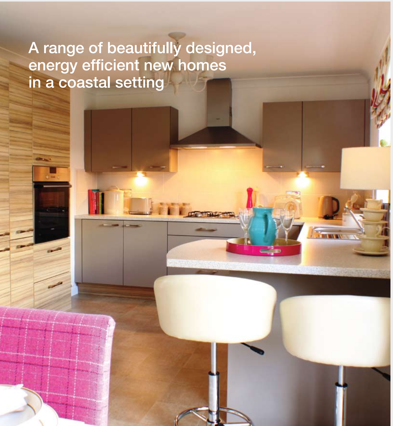
Typical Mactaggart and Mickel interior

A range of beautifully designed, energy efficient new homes in a coastal setting