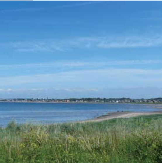
Beach walks nearby

In a delightful location just moments from Ayrshire's glorious coastline, and on the threshold of beautiful, rolling countryside, Greenan Views is also perfectly located to take advantage of the extensive choice of amenities and attractions in the town of Ayr and beyond.