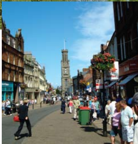
Shopping in Ayr