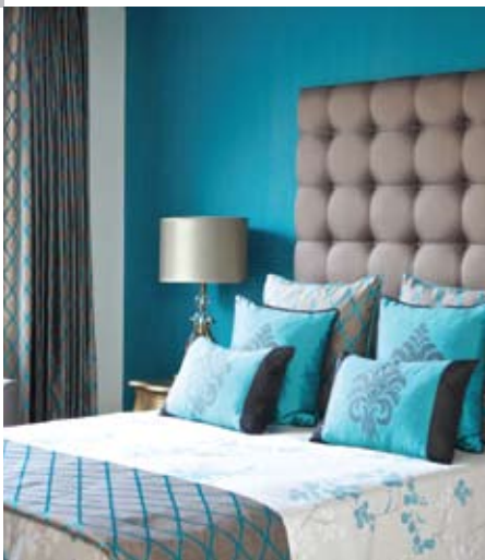
Colonsay show home at Greenan Views

The Island Choice completes the first phase, offering a superb, varied choice of two, three, four and five bedroom villas; beautifully designed, energy efficient homes.