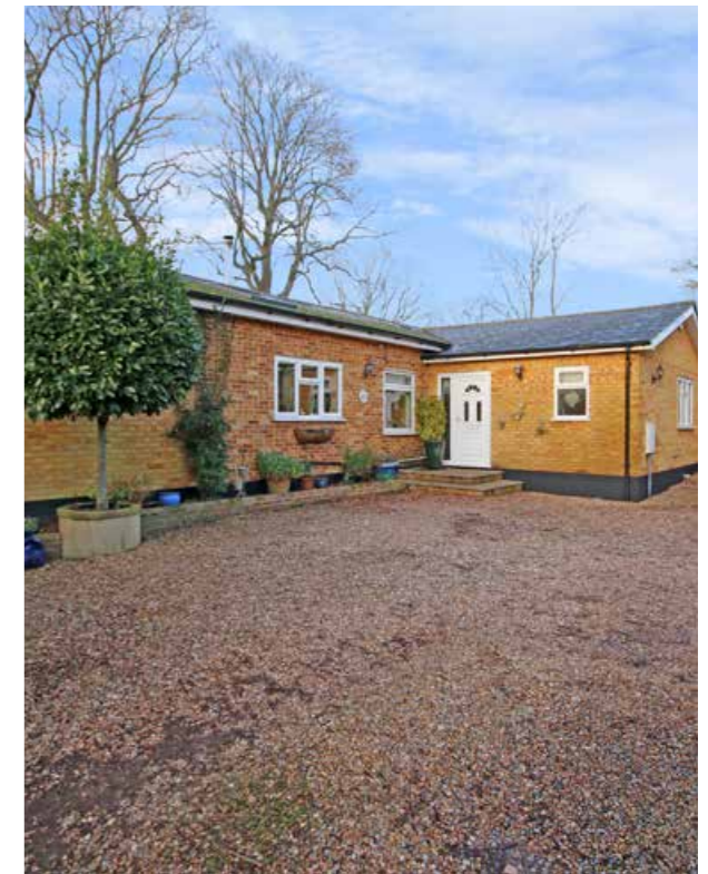
A surprise awaits inside

The kitchen offers an expanse of working space with cupboards and drawers to keep all the essential items in and those 'once a year' things we all have or would like to have.