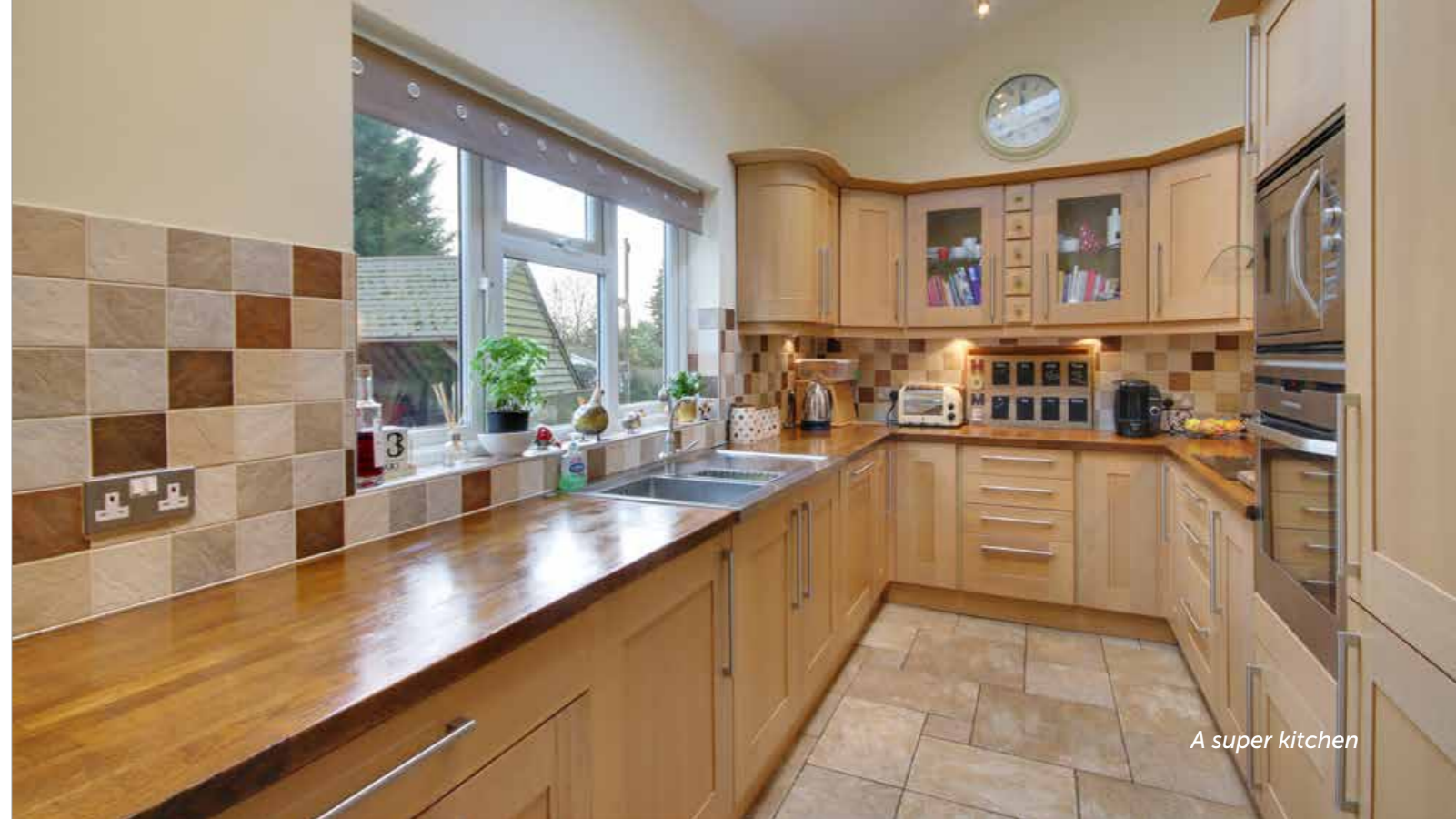
A super kitchen