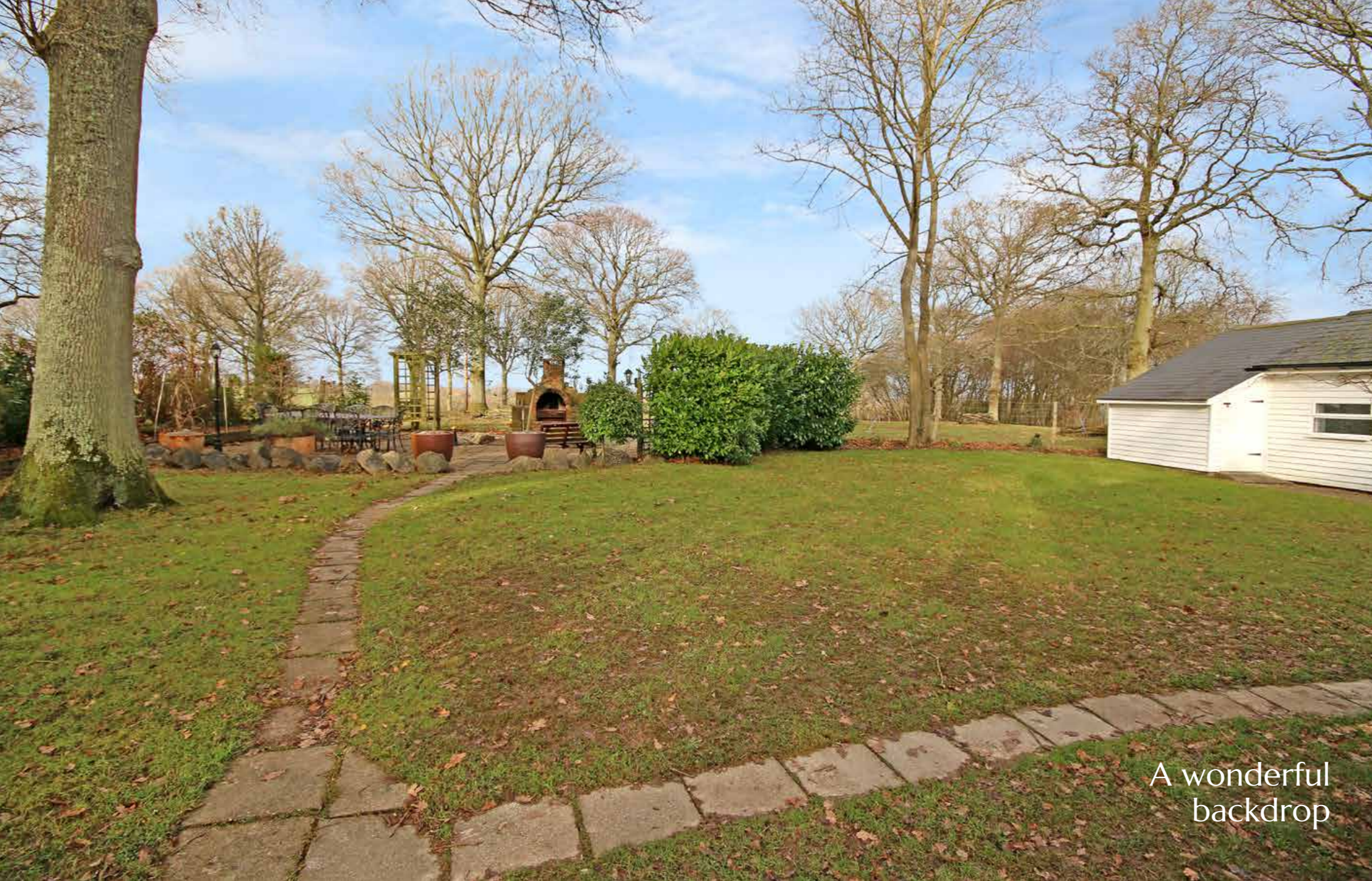
A wonderful backdrop