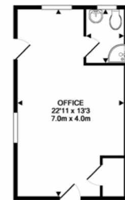
OUTBUILDINGS APPROX. FLOOR AREA 1097 SQ.FT. (101.9 SQ.M.)

Important notice. Graham John and their clients give notice that 1) They are not authorised to make or give any representations or warranties in relation to the property either here or elsewhere, either on their own behalf or on behalf of their client or otherwise. They assume no responsibility for any statement that may be made in these particulars. These particulars do not form part of any offer or contract and must not be relied upon as statements or representations of fact. 2) Any areas, measurements or distances are approximate. The text, photographs and plans are for guidance only and are not necessarily comprehensive. It should not be assumed that the property has all necessary planning, building regulation or other consents and Graham John have not tested and services, equipment or facilities. Purchasers must satisfy themselves by inspection or otherwise.