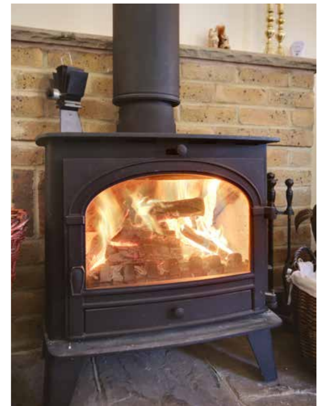
Country charm in front of a real fire