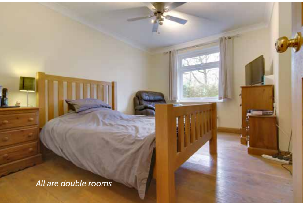
All are double rooms