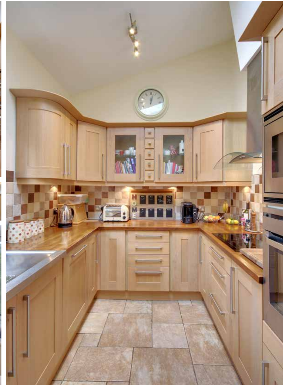
There's a place for everything

This home is all about having fun and enjoying time with the family and your friends. How you use space will be entirely up to you. The vaulted ceiling gives the main living space a captivating feel and wows everyone who visits.