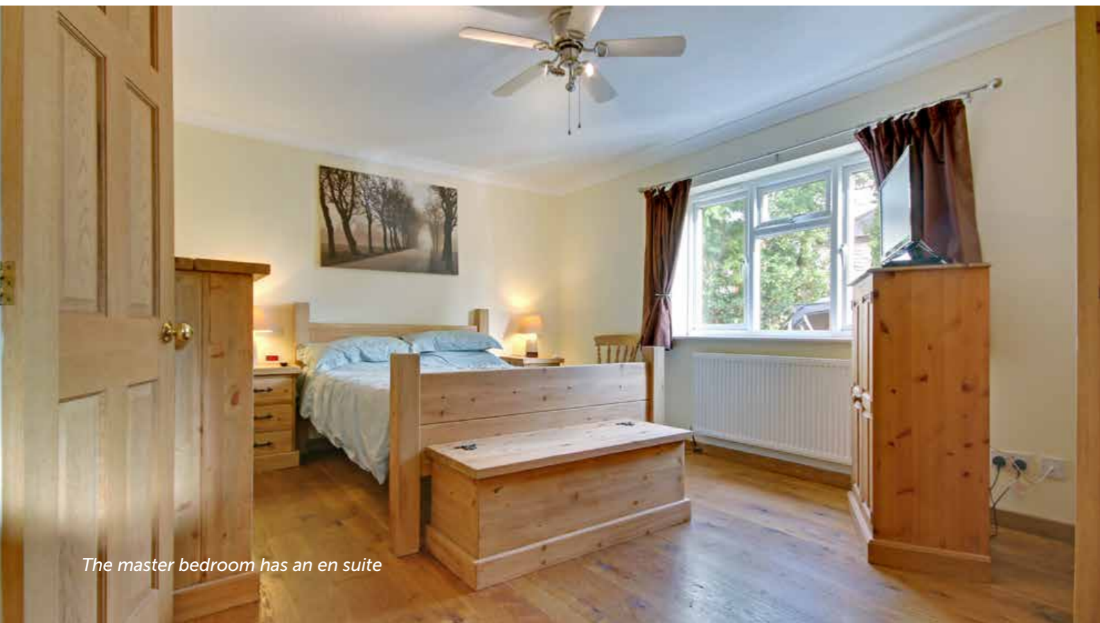
The master bedroom has an en suite