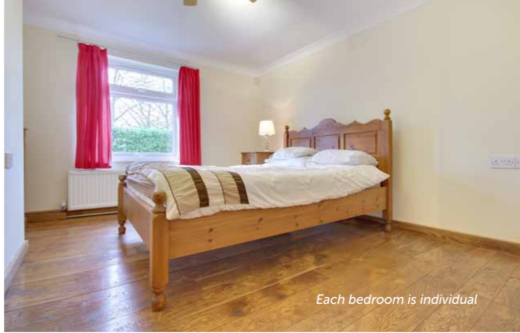
Each bedroom is individual