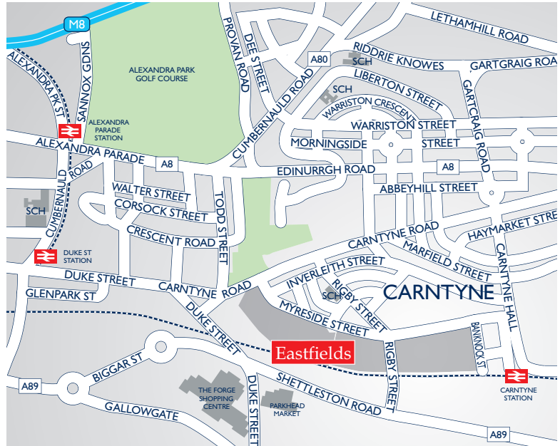
Eastfields, Myreside Street, Carntyne, Glasgow G32 6DX