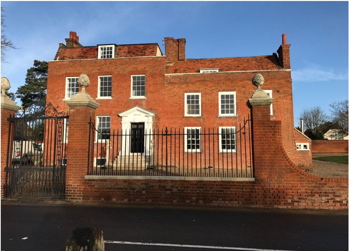
Cedar House, Mill Road, Cobham, Surrey, KT11 3AL Price on Application