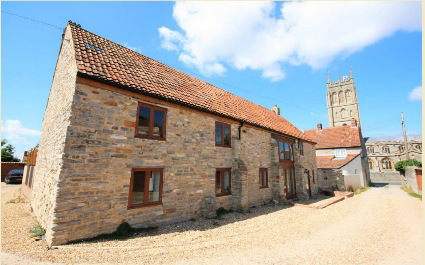
Tithe Barn Main Road Westonzoyland TA7 0EB