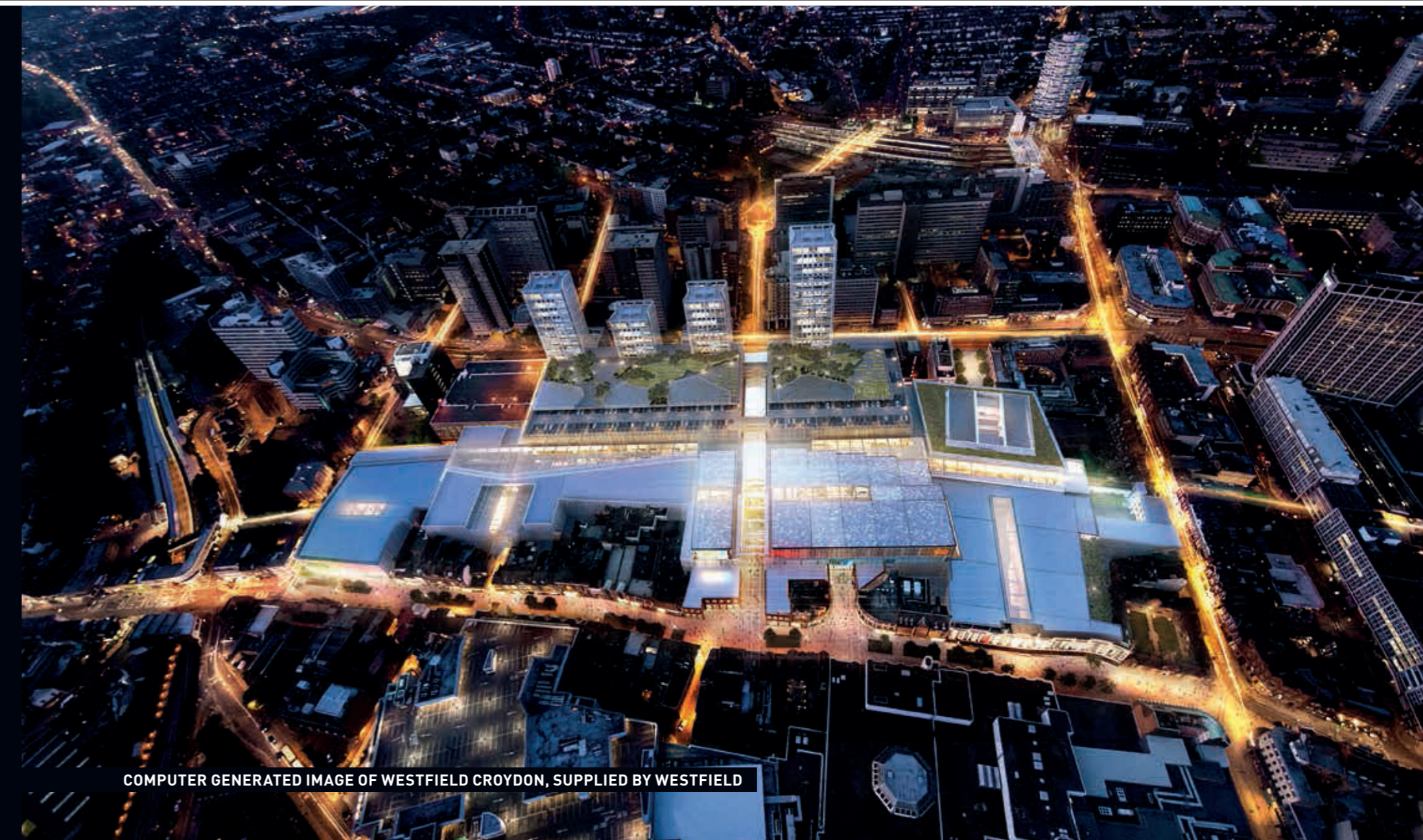
COMPUTER GENERATED IMAGE OF WESTFIELD CROYDON

This exciting regeneration of Croydon town centre will greatly benefit local businesses, and also families who will be able to enjoy a safe, new shopping destination.