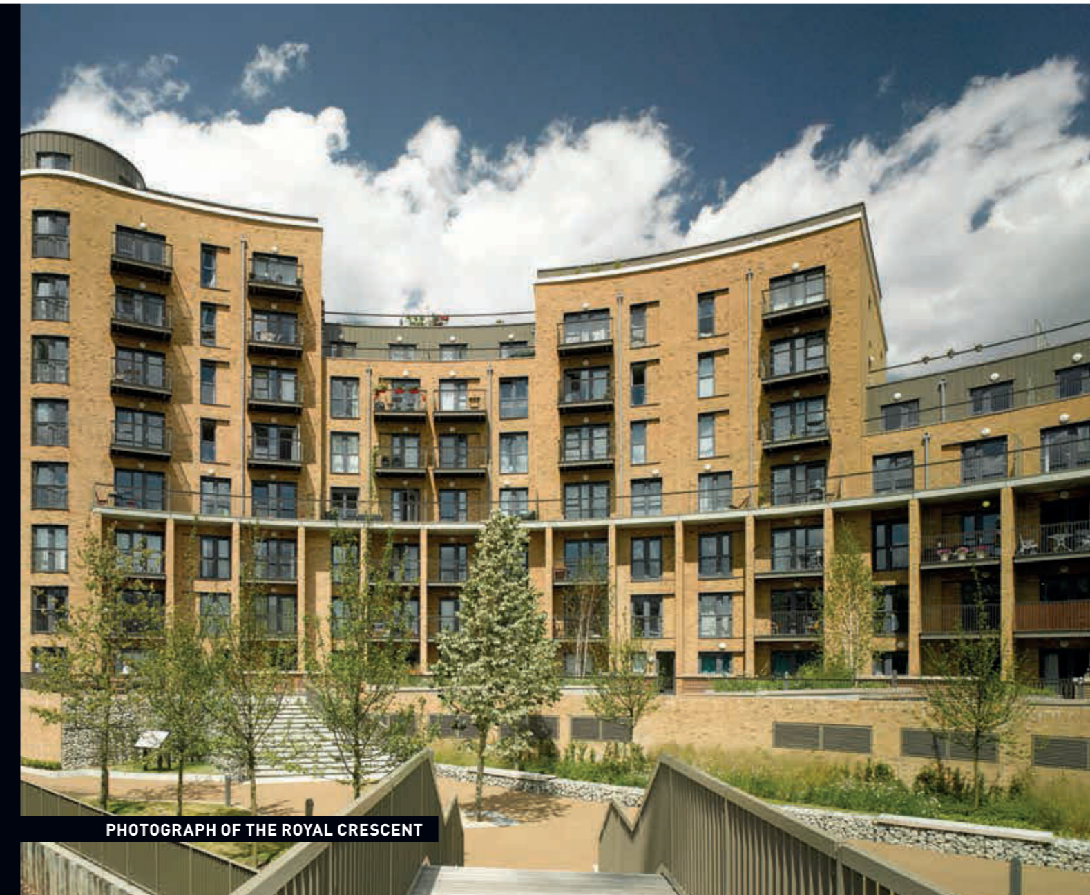
PHOTOGRAPH OF THE ROYAL CRESCENT

A development of spectacular scale and vision, NSQ includes 923 stylish new 1 bedroom suites and 1, 2 and 3 bedroom apartments. NSQ is focused around the central Royal Crescent and Palladian Court, a modern take on the village green where the River Wandle flows through the centre, creating a relaxing oasis for residents. At NSQ you really can have it all; great transport links on the doorstep take you into and out of the city with ease, yet acres of open space and the countryside are nearby when you wish to escape the hustle and bustle.