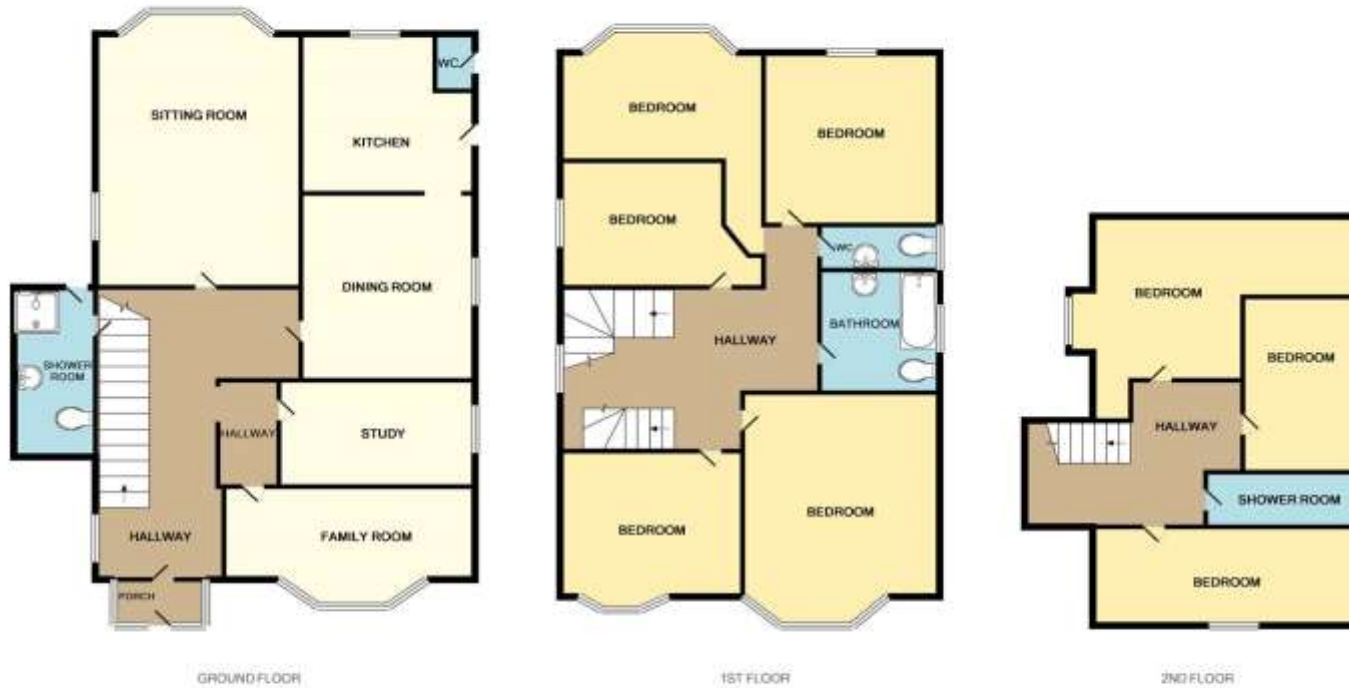
This Floor Plan is for guidance only and is NOT to SCALE Made with Metropix ©2017

Sitting Room 5.3m (17'5) plus bay x 4.1m (13'5)