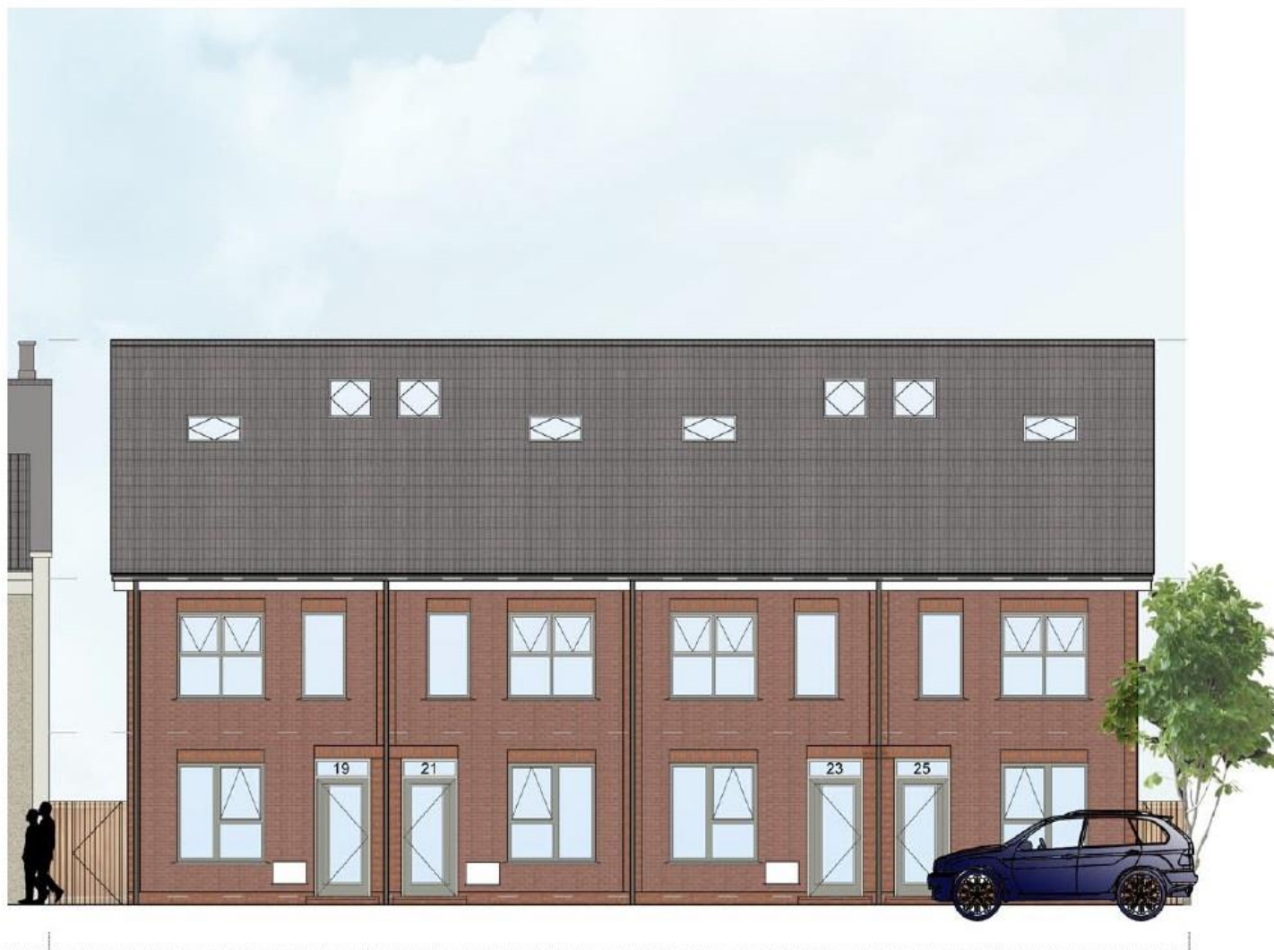
Midland Terrace, Bristol, BS16 3DH