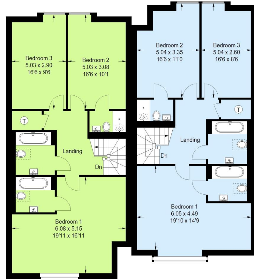
31- First Floor