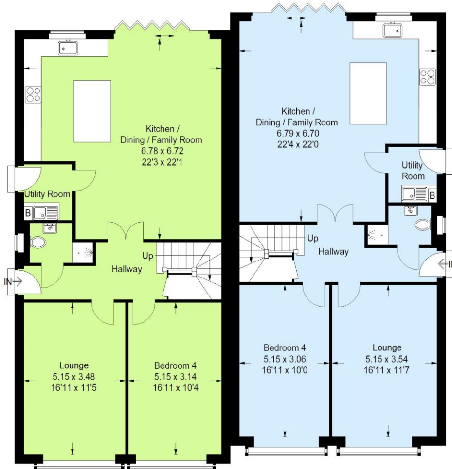
31- Ground Floor