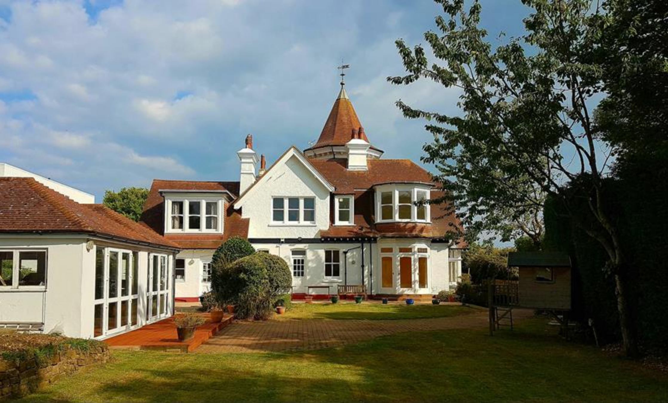
The Turret House, Filsham Road, St. Leonards-On-Sea, TN38 0PA