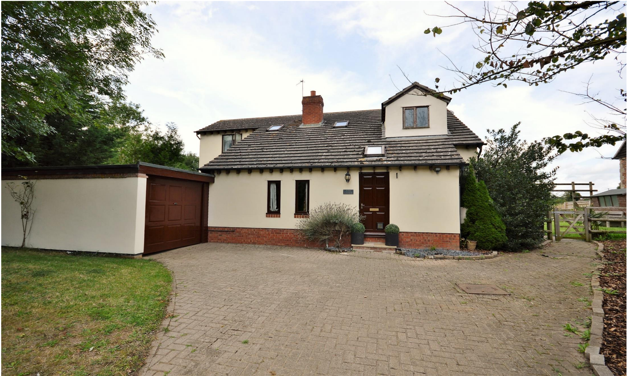
Ash Lodge Tiddington