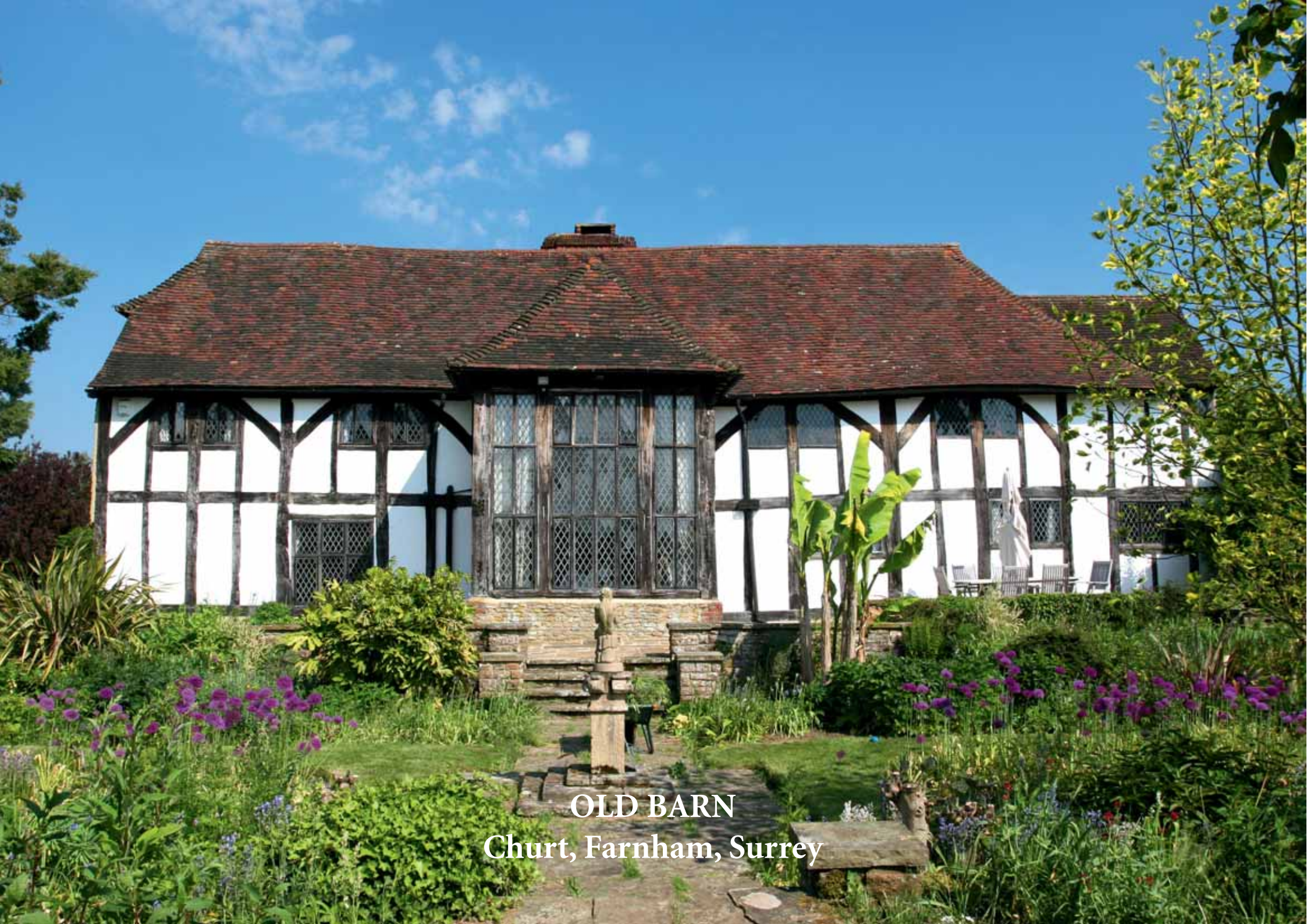
OLD BARN Churt, Farnham, Surrey