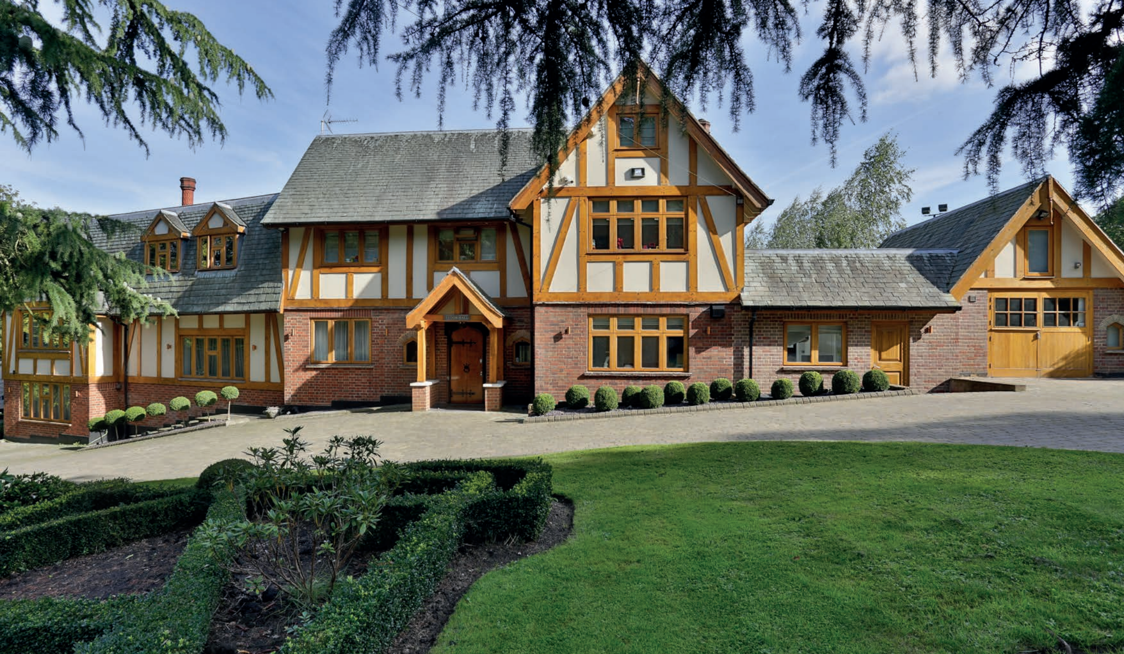
Tudor Hall Vineyards Road | Northaw | Hertfordshire | EN6 4PE