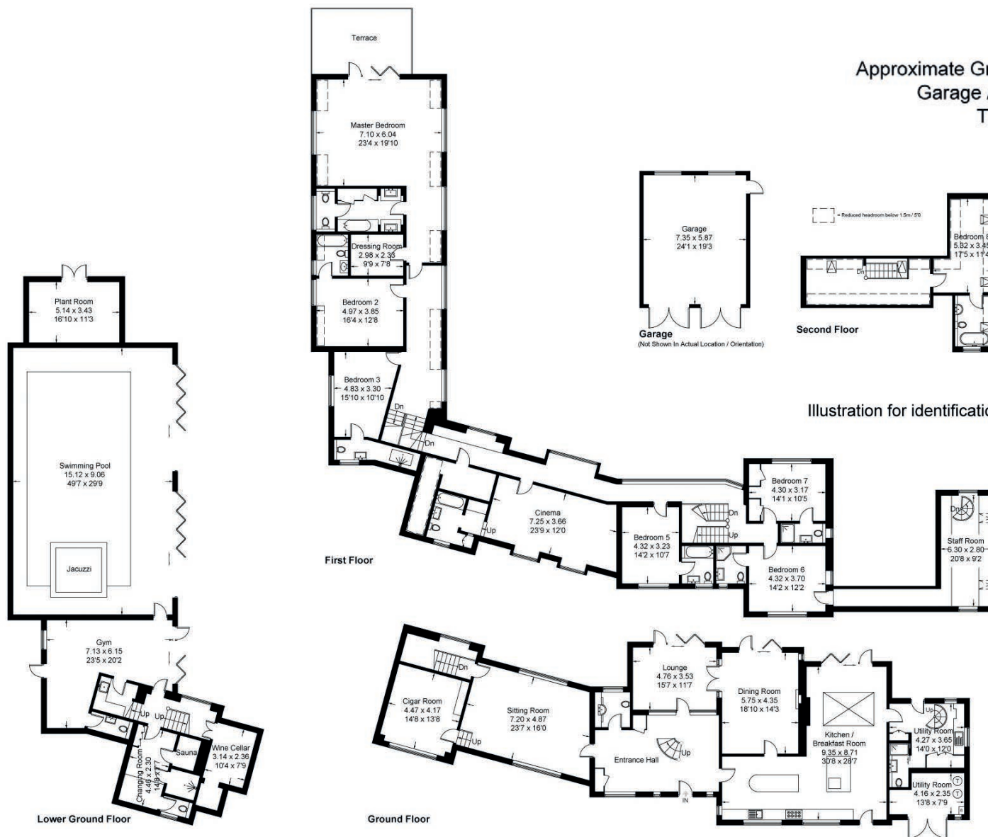
Illustration for identification purposes only, measurements are approximate, not to scale. (ID310283)