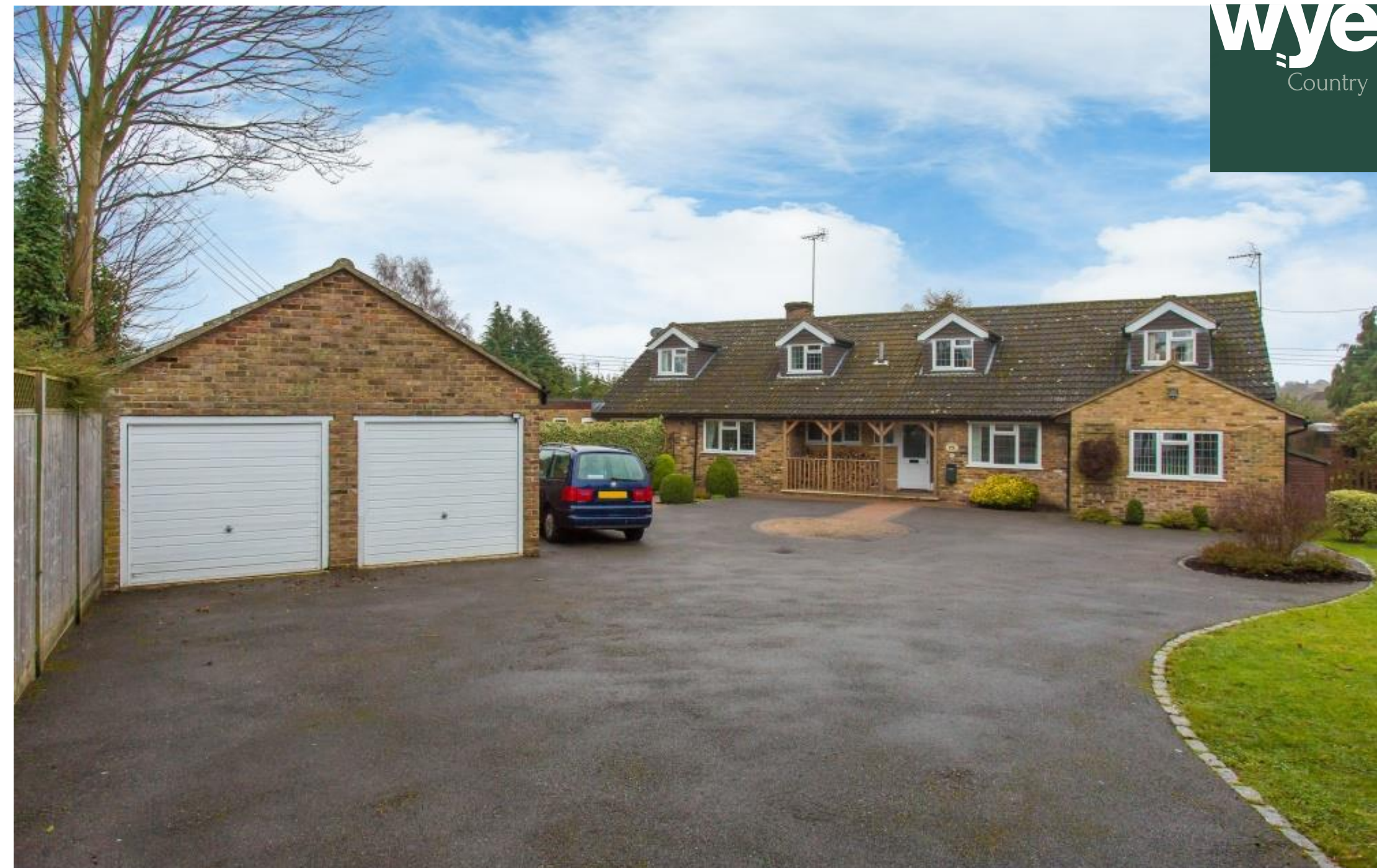
FAIRFIELD HOUSE 29a FAIRFIELDS GREAT KINGSHILL BUCKINGHAMSHIRE HP15 6EP