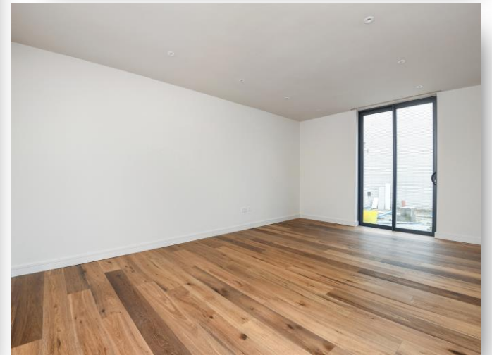
Plum Tree Mews, Streatham Common South, Streatham Common, SW16 3BX