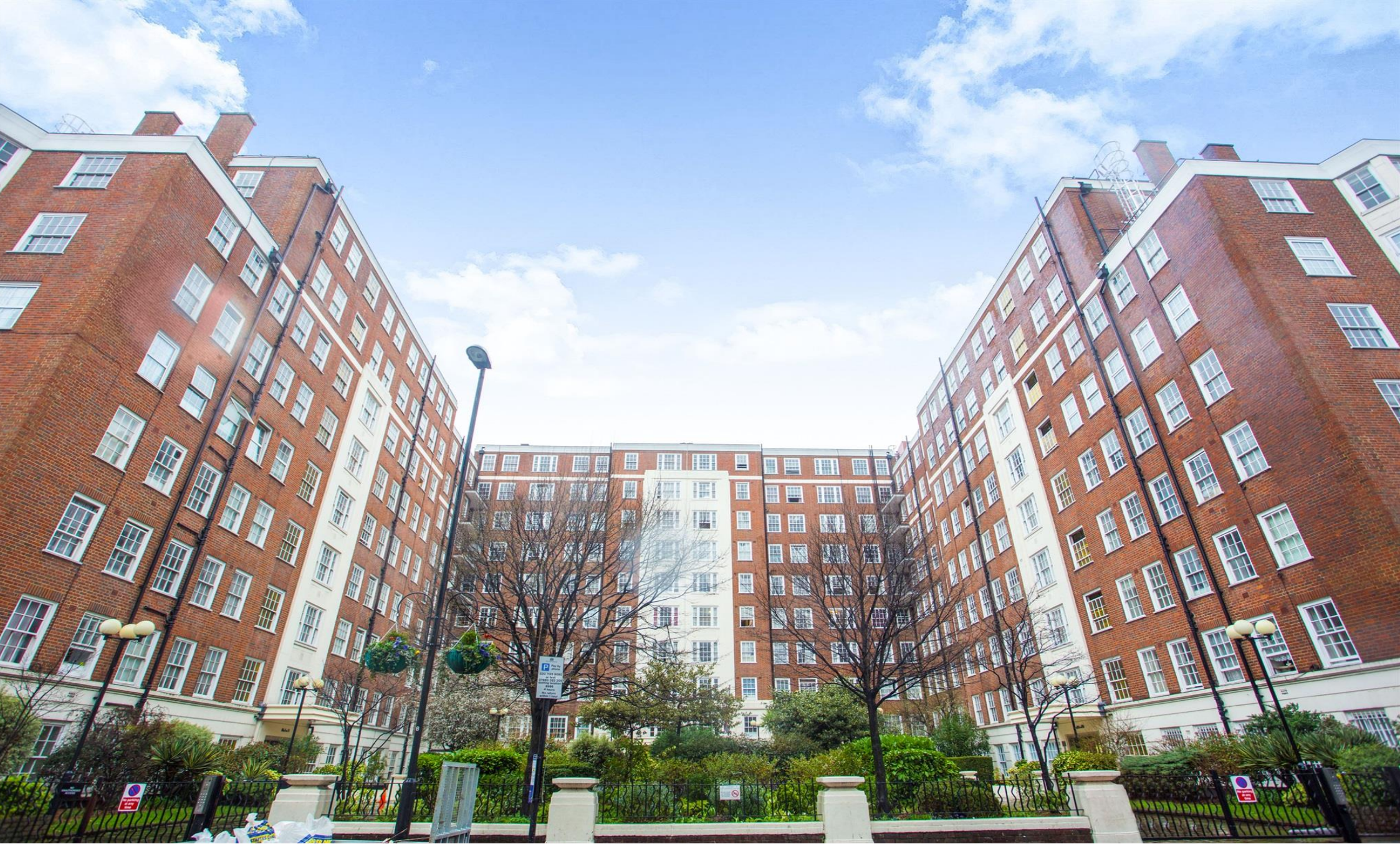
Park West, Edgware Road, London, W2 2QP