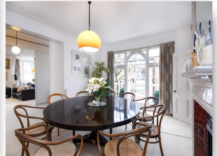
Hornsey Lane Gardens, Highgate, N6, N6 5NY