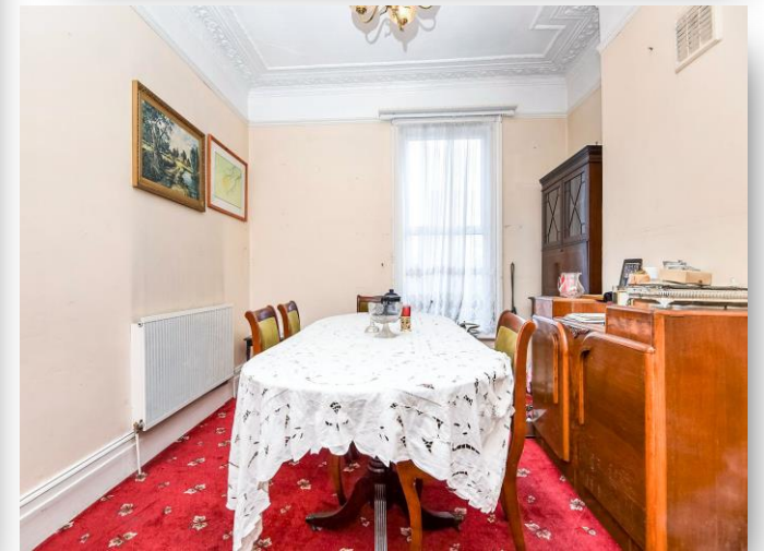
Appach Road, Brixton, SW2 2LE