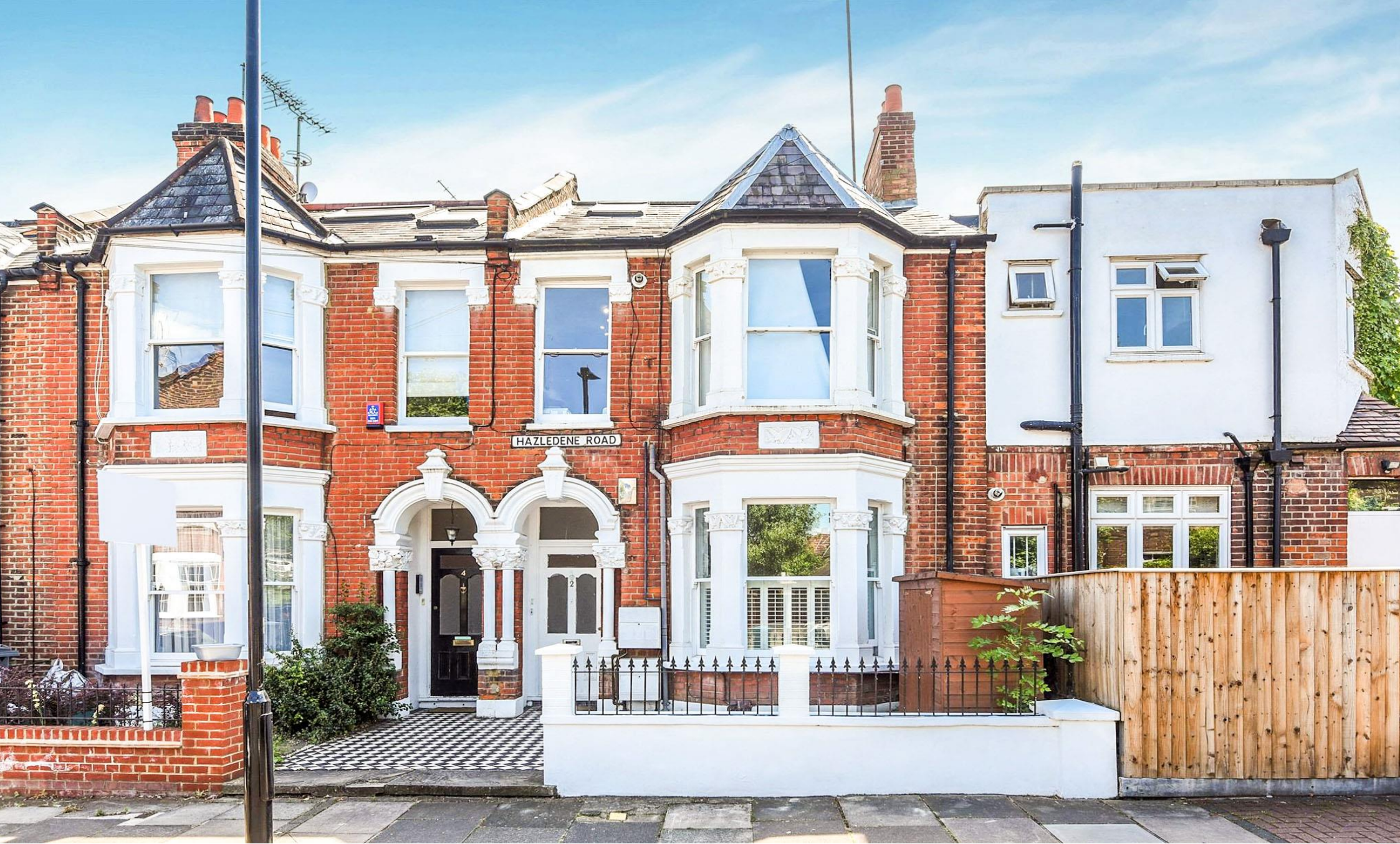
Ground Floor Flat, Hazledene Road, London, W4 3JB