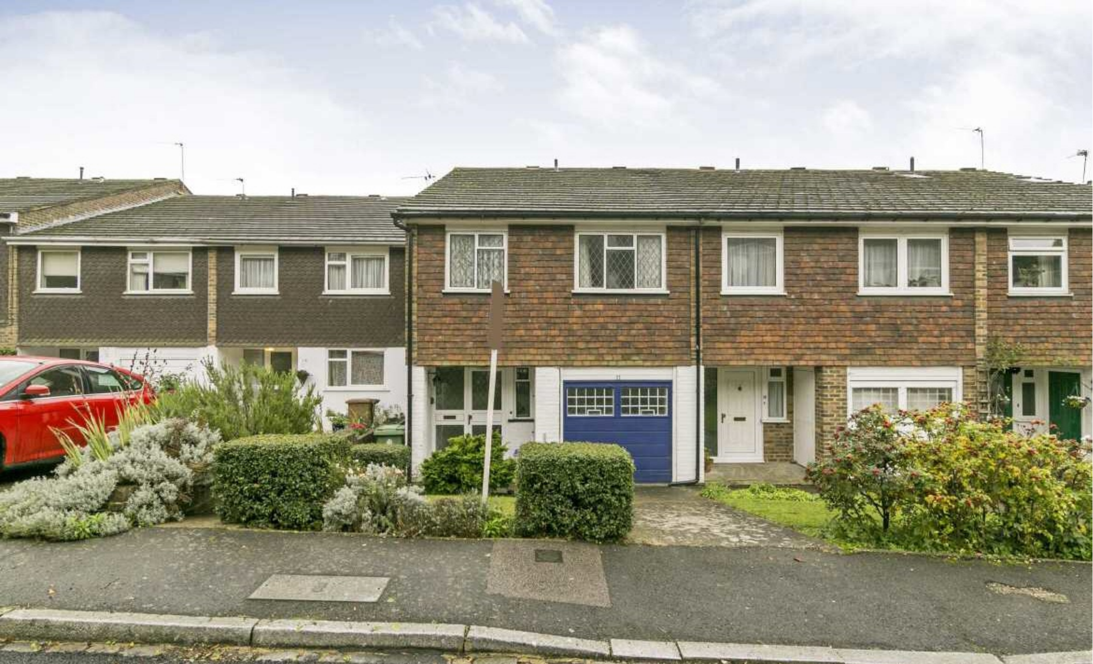
Hillview, London, SW20 0TA