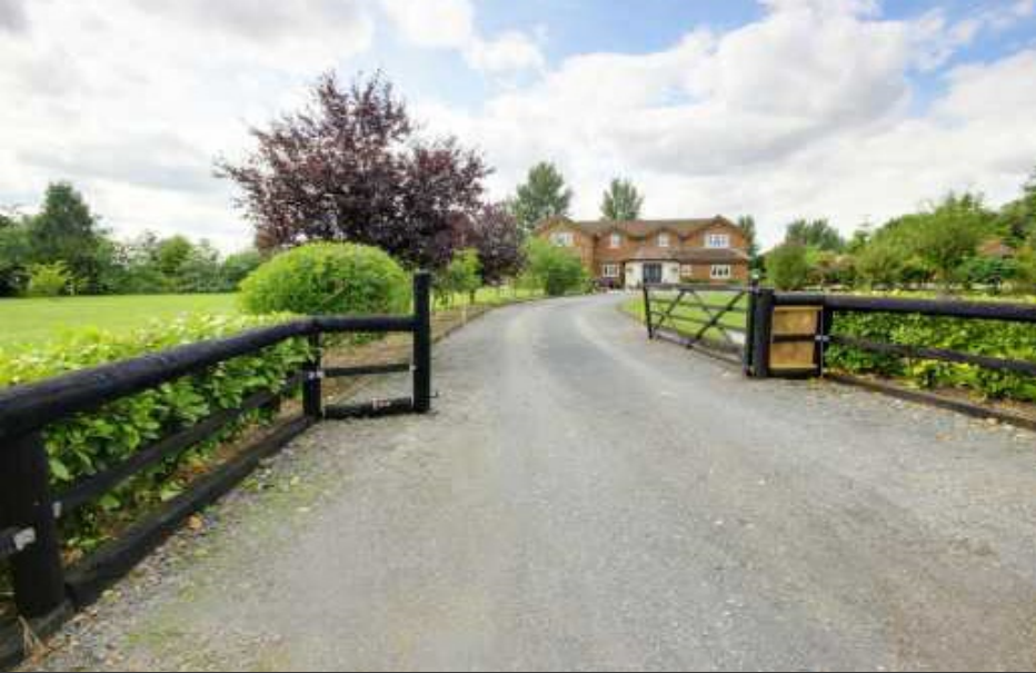
Linden Lodge, Bulls Lane Bell Bar, Hertfordshire AL9 7BB