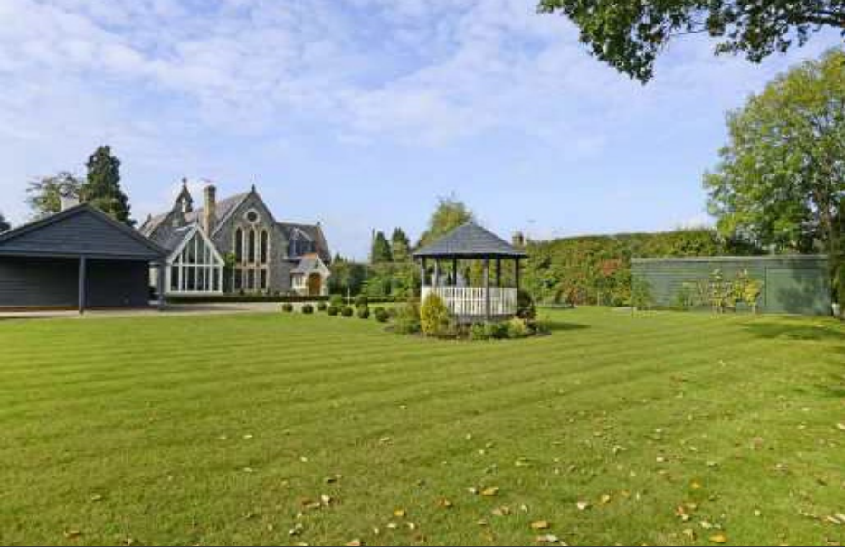
St Johns Church, Chapel Lane Letty Green, Hertfordshire SG14 2PA