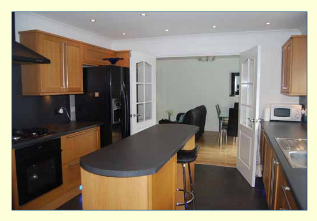
6 School Lane, Milton of Campsie, G66 8DD

Luxurious Architect designed detached villa (built 2009) set behind electric gates, with a splendid private garden.