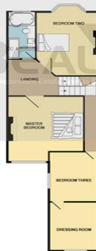
1ST FLOOR APPROX. FLOOR AREA 858 SQ.FT. (249.9 SQ.M.)