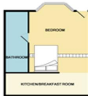
BASEMENT LEVEL APPROX. FLOOR AREA 456 SQ.FT. (136.8 SQ.M.)

BATHROOM 13' 05" x 4' 00" (4.09m x 1.22m)