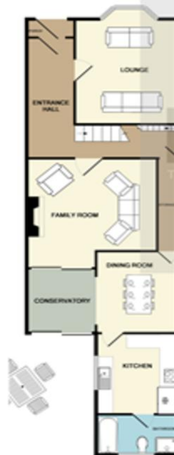
GROUND FLOOR APPROX. FLOOR AREA 1086 SQ.FT. (316.8 SQ.M.)