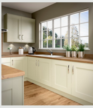
*Cranbrook and Woodbury images shown are for visual representation only and are not specific to Whittingham Place