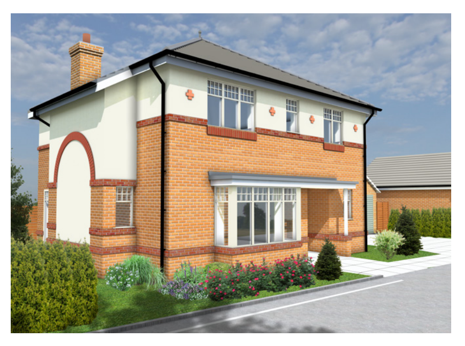
Thistle Magnetic Plaster from British Gypsum

The same is true of our interiors. We're constantly researching new building methods and materials to ensure that your home feels like a home should - solid. Using the very latest building materials, Whittingham Place is the only development in the area to use a wall material that completely eliminates the "flimsy Wall" feeling you get with many new builds. Not ours! Our homes are built to last, uncompromising in their quality.