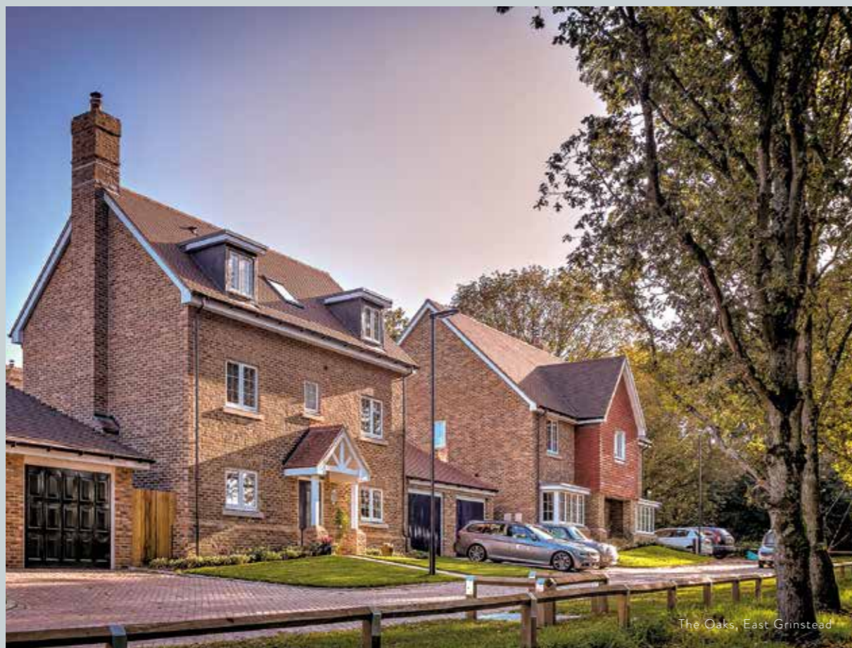
The Oaks, East Grinstead

CONSUMER CODE FOR HOME BUILDERS www.consumercode.co.uk