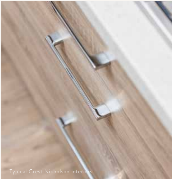
Typical Crest Nicholson interiors

The neutral décor throughout ensures each room feels light and airy and the fluent layout encourages natural light to flood in. Every space has been designed with modern living in mind. The high specification kitchen comes complete with integrated Bosch appliances, creating the perfect setting for hosting lively dinner parties. The bathroom is just as stylish, fitted with Roca Gap sanitaryware and finished with a clean colour palette, providing you with a calm and tranquil place to relax and unwind in.