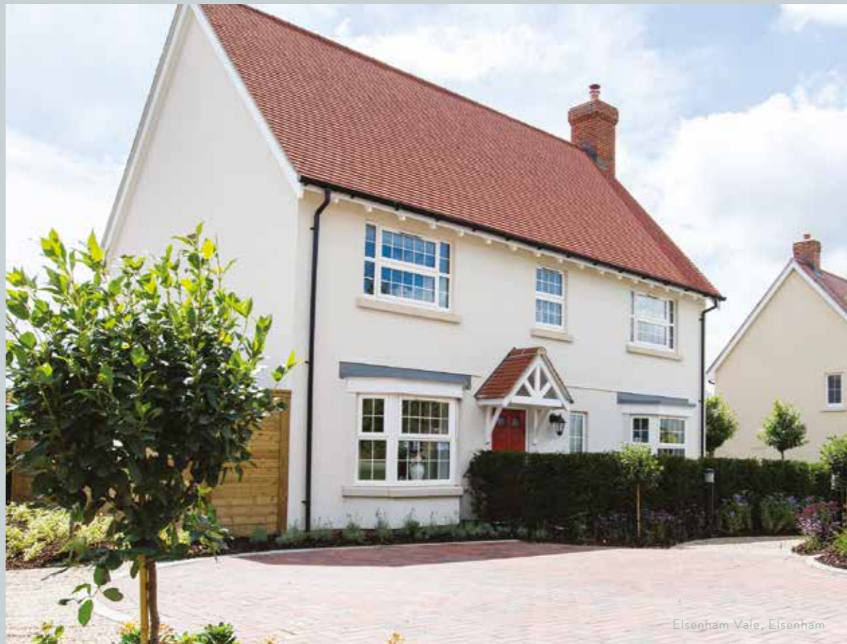
Elsenham Vale, Elsenham