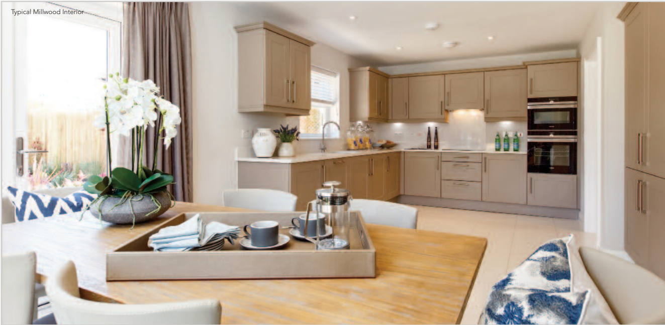
Typical Millwood Interior