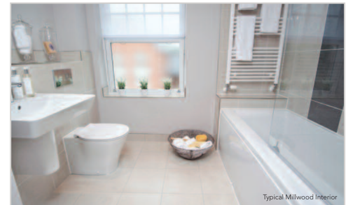
Typical Millwood Interior

This brochure has been produced for your guidance only. Whilst every care has been taken, its accuracy cannot be guaranteed. Millwood Designer Homes Ltd reserves the right to change the specification without prior notice. The photographs shown within this brochure are indicative of the quality of a Millwood Designer home and do not necessarily relate to the housetypes.