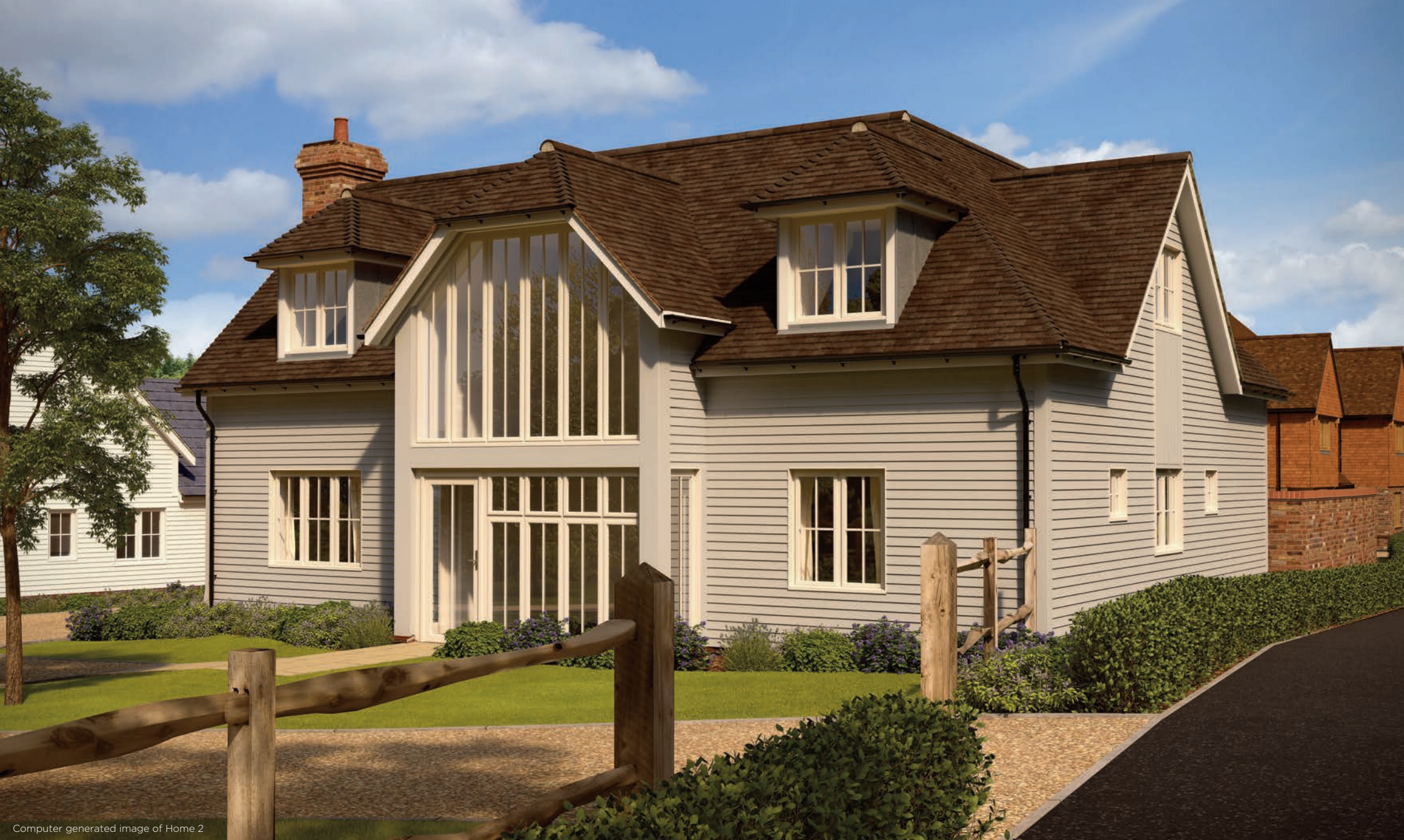
Computer generated image of Home 2