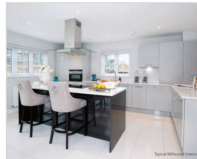
Typical Millwood Interior

This brochure has been produced for your guidance only. Whilst every care has been taken, its accuracy cannot be guaranteed. Millwood Designer Homes Ltd reserves the right to change the specification without prior notice. The photographs shown within this brochure are indicative of the quality of a Millwood Designer home and do not necessarily relate to the houstypes.*Internal photography of typical Millwood Designer Homes interiors.