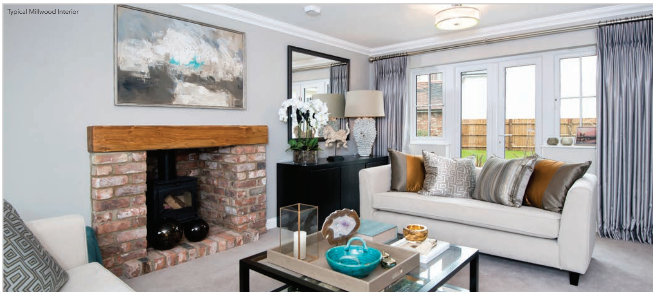
Typical Millwood Interior